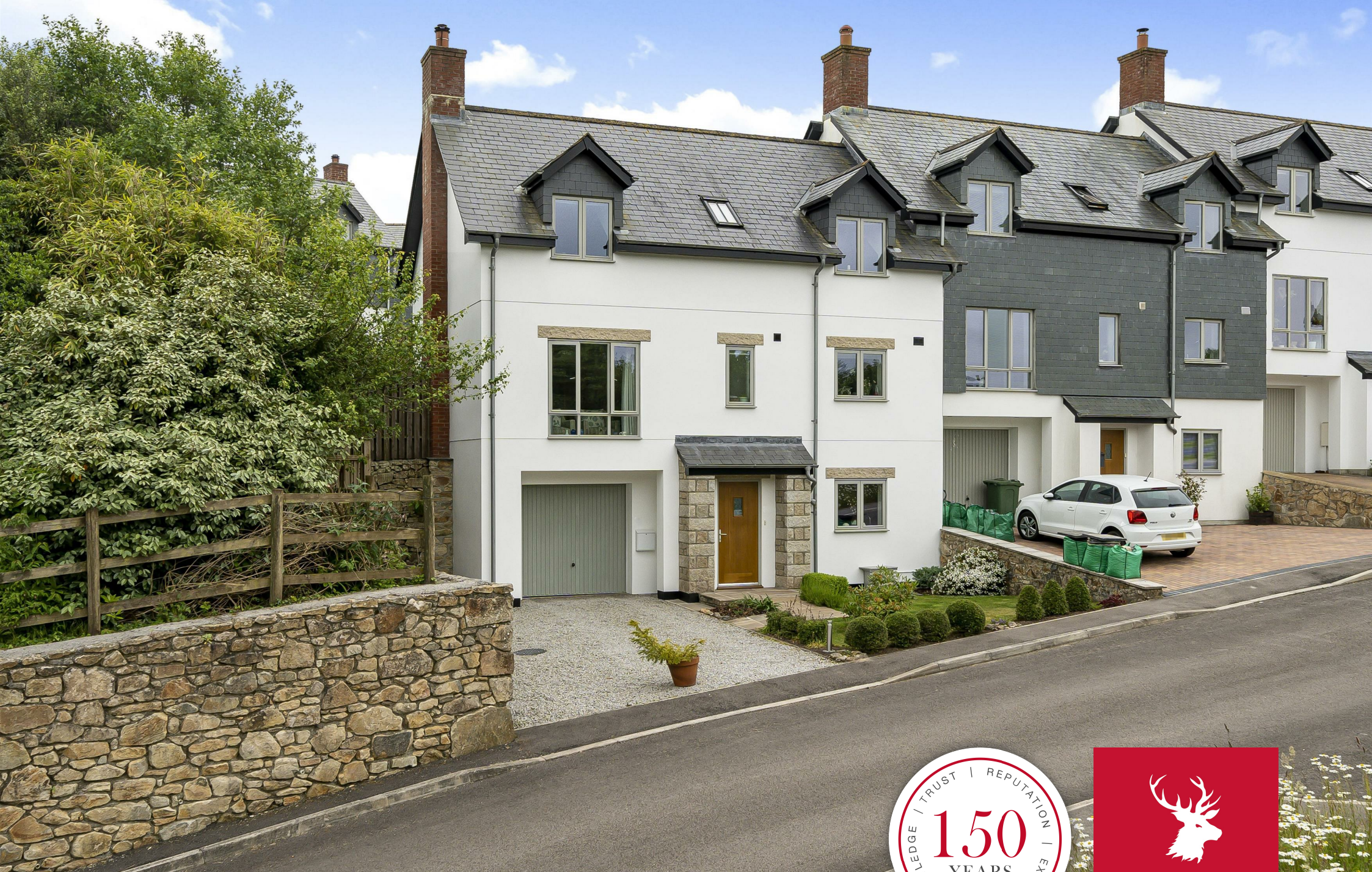
1, Furze Croft