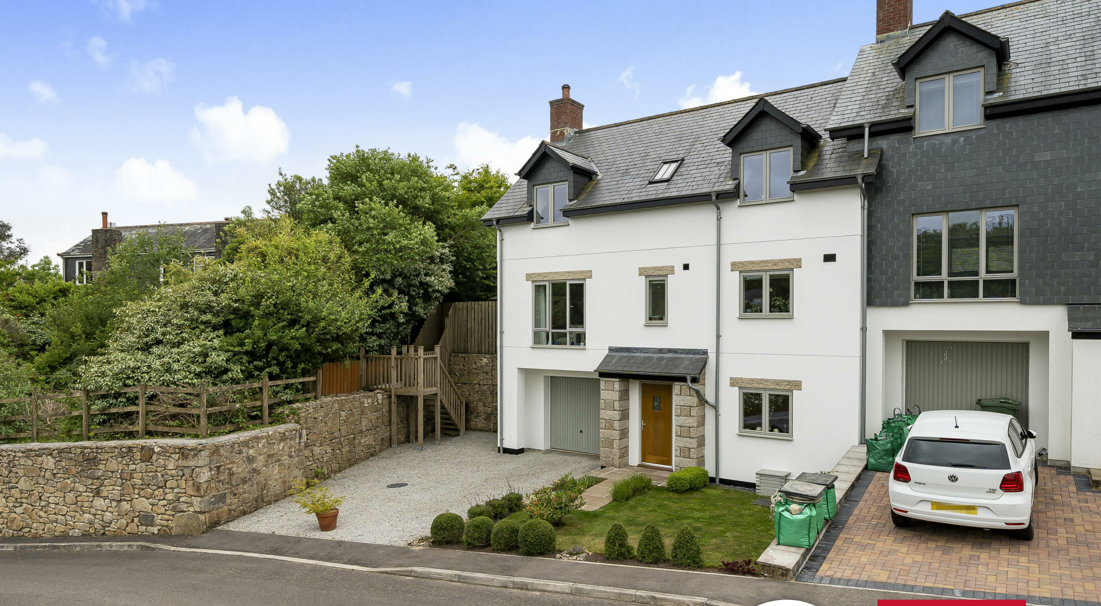
1 Furze Croft