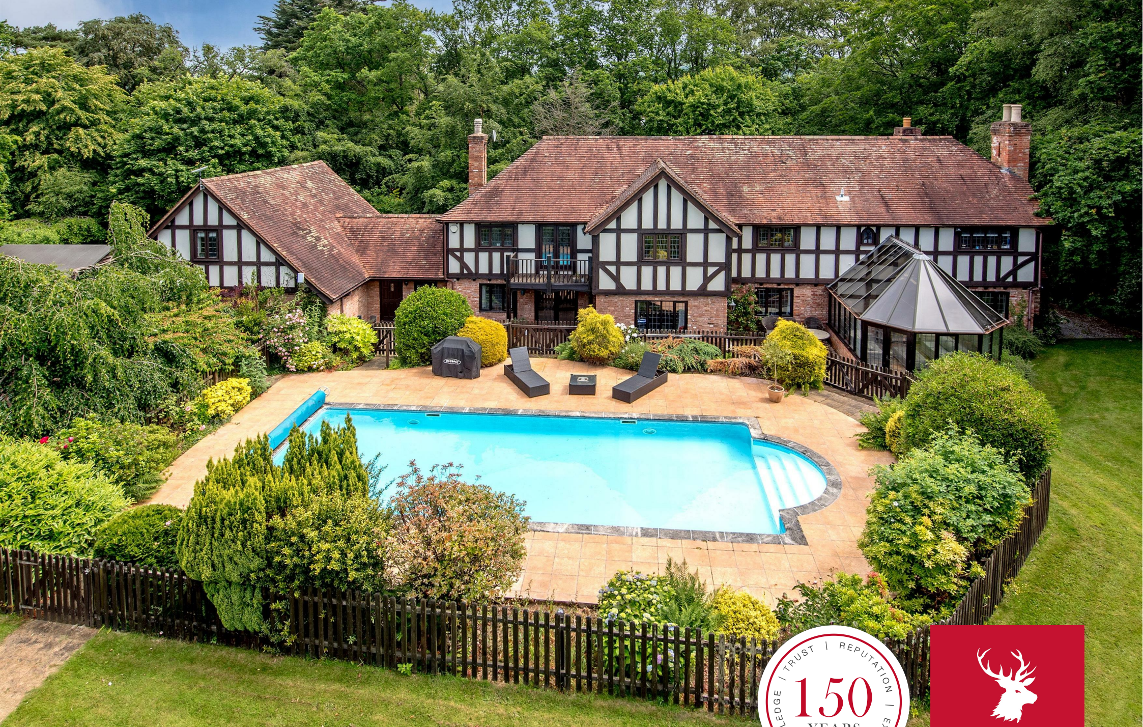
Broad Oak House