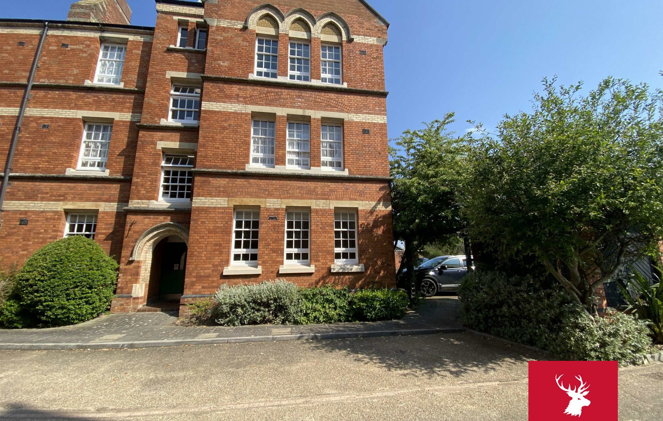
22 Jellalabad Court