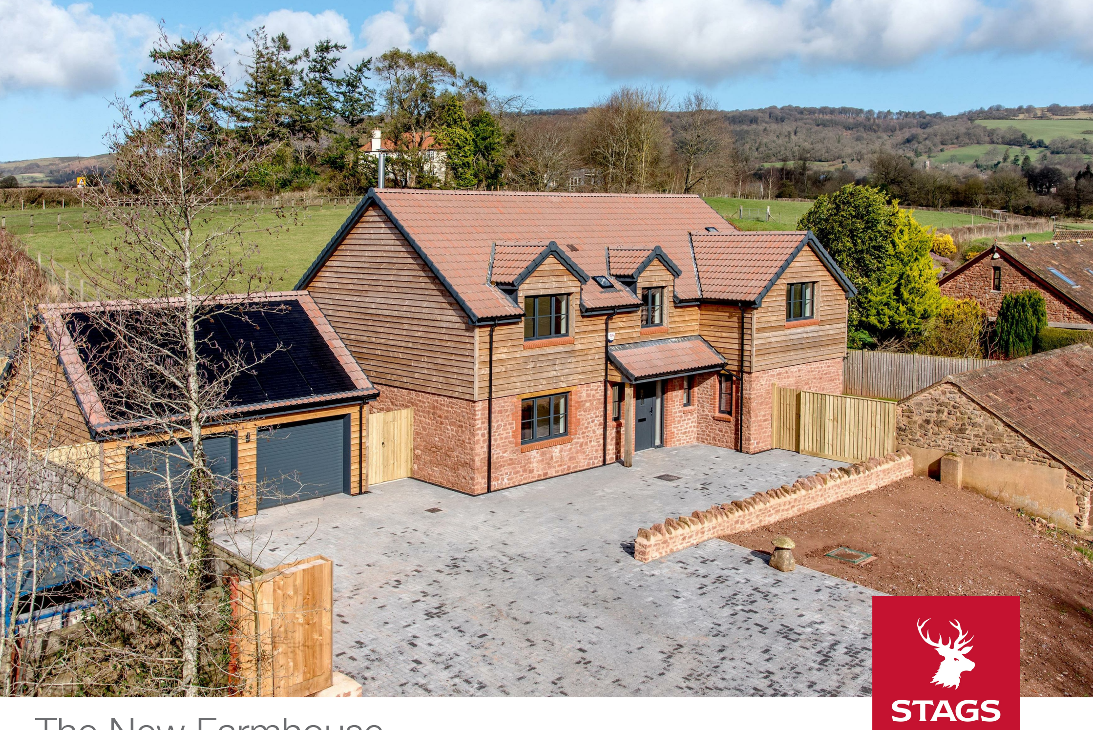
The New Farmhouse