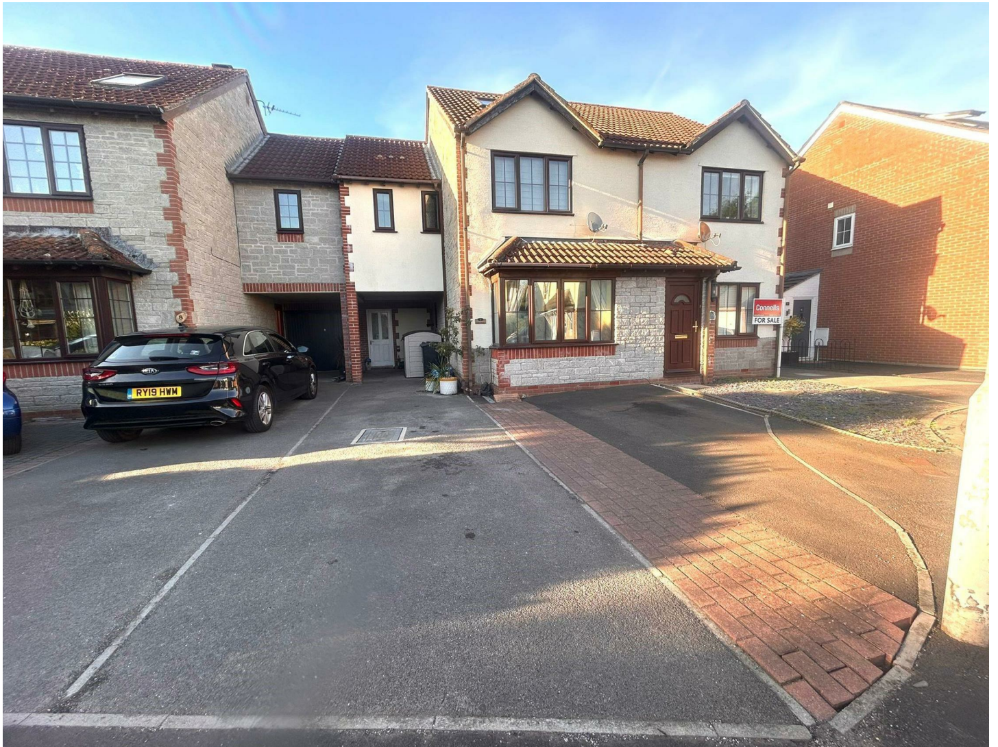
9 Virginia Orchard