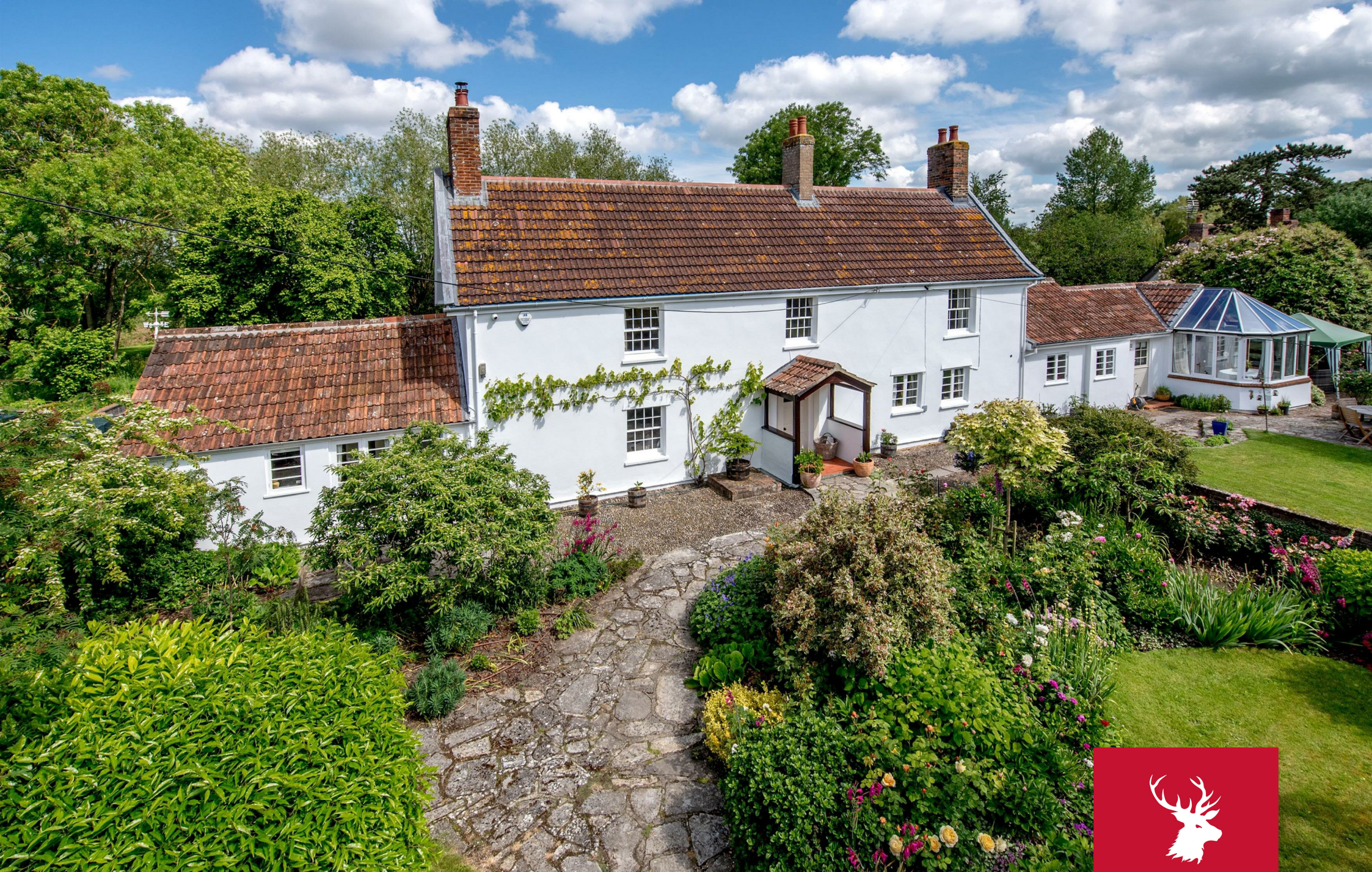
Ham Wharf House