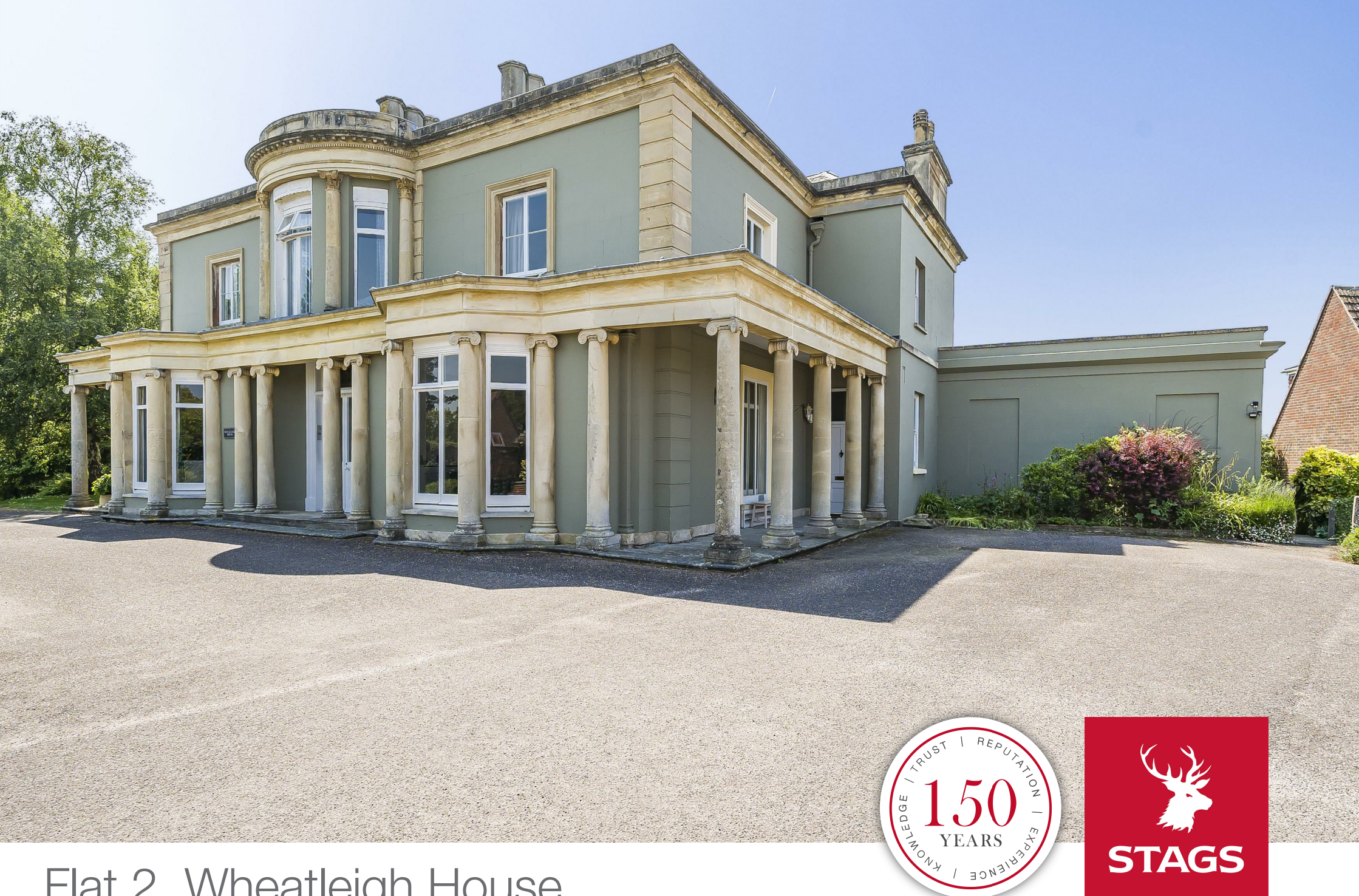
Flat 2, Wheatleigh House