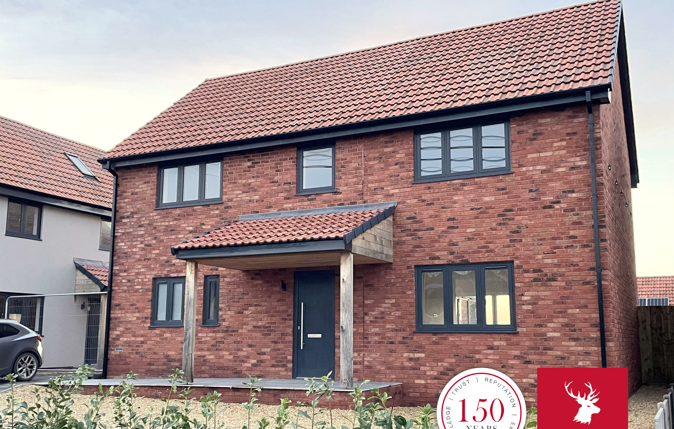
Burrow House, North Lane