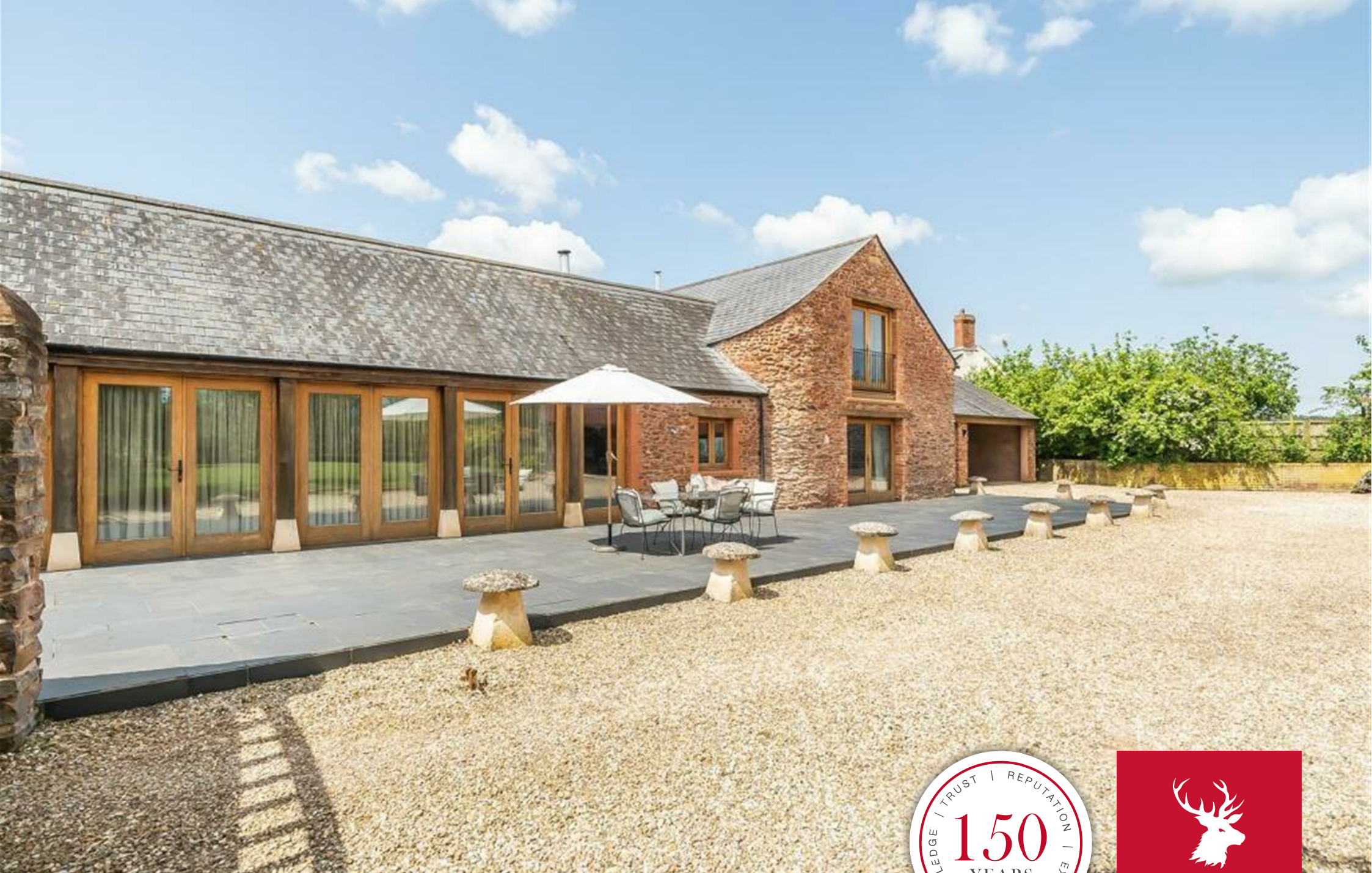
Chapel Hill Barn