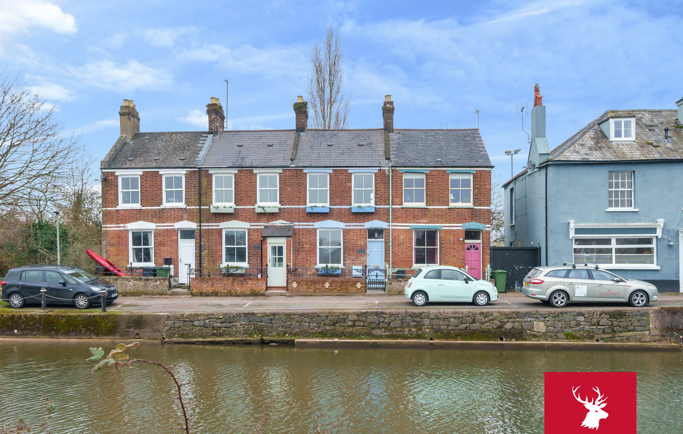
3 Exe View Cottages