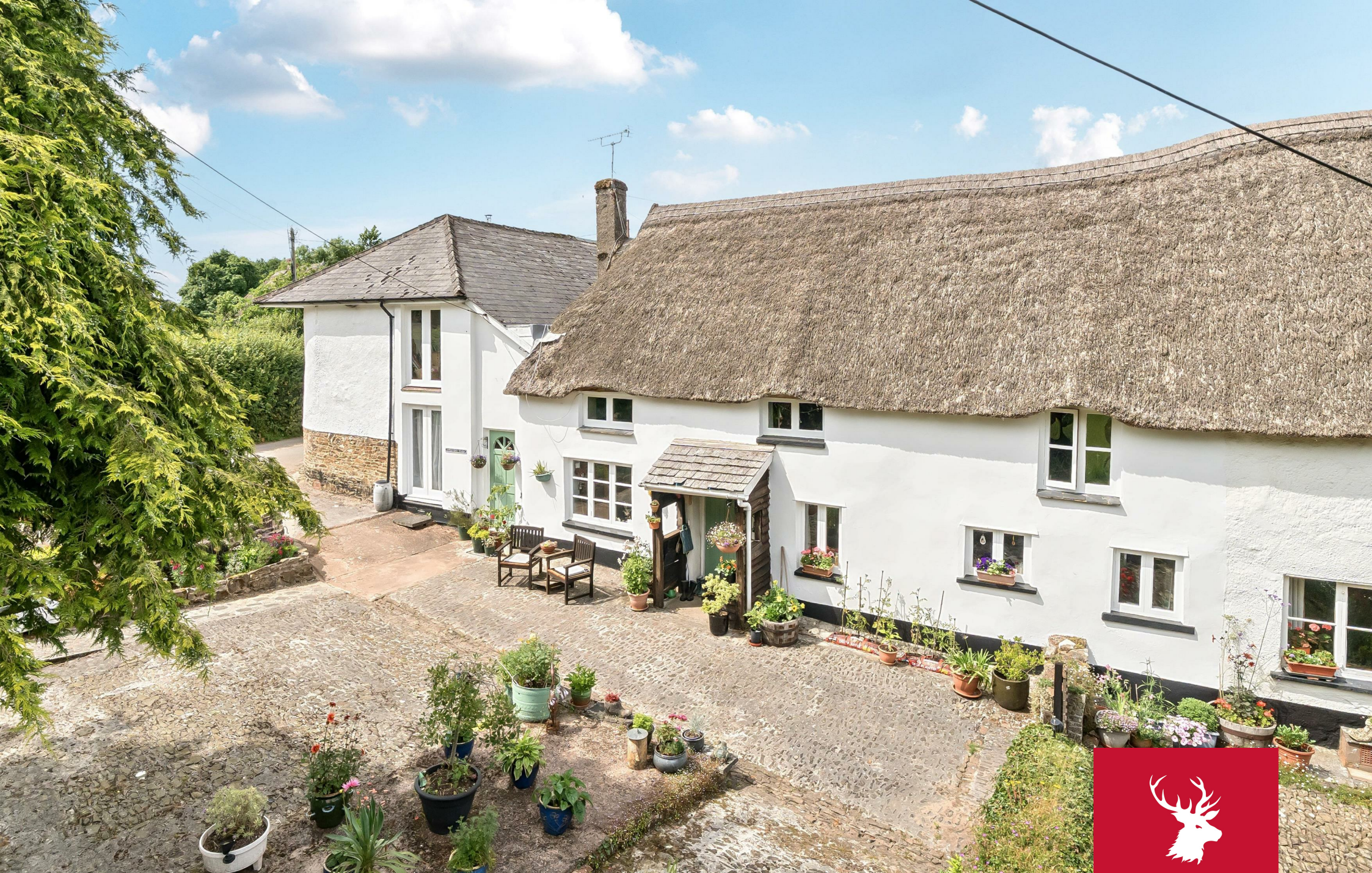
1 Eppletons Farm