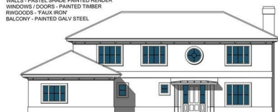
NORTH EAST ELEVATION PLOT 1

PLOT 1 MATERIALS ROOF - RECONSTITUTED NATURAL SLATE CORBELS - PAINTED TIMBER WALLS - PASTEL SHADE PAINTED RENDER WINDOWS / DOORS - PAINTED TIMBER RWGWOODS - 'FAUX IRON' BAL CONY - PAINTED GALV STEEL