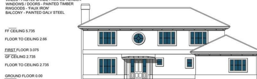
NORTH EAST ELEVATION PLOT 2

PLOT 2 MATERIALS ROOF - RECONSTITUTED NATURAL SLATE CORBELS - PAINTED TIMBER WALLS - PASTEL SHADE PAINTED RENDER WINDOWS - DOORS - PAINTED TIMBER RWGOODS - 'FAUX IRON' BALCONY - PAINTED GALV STEEL