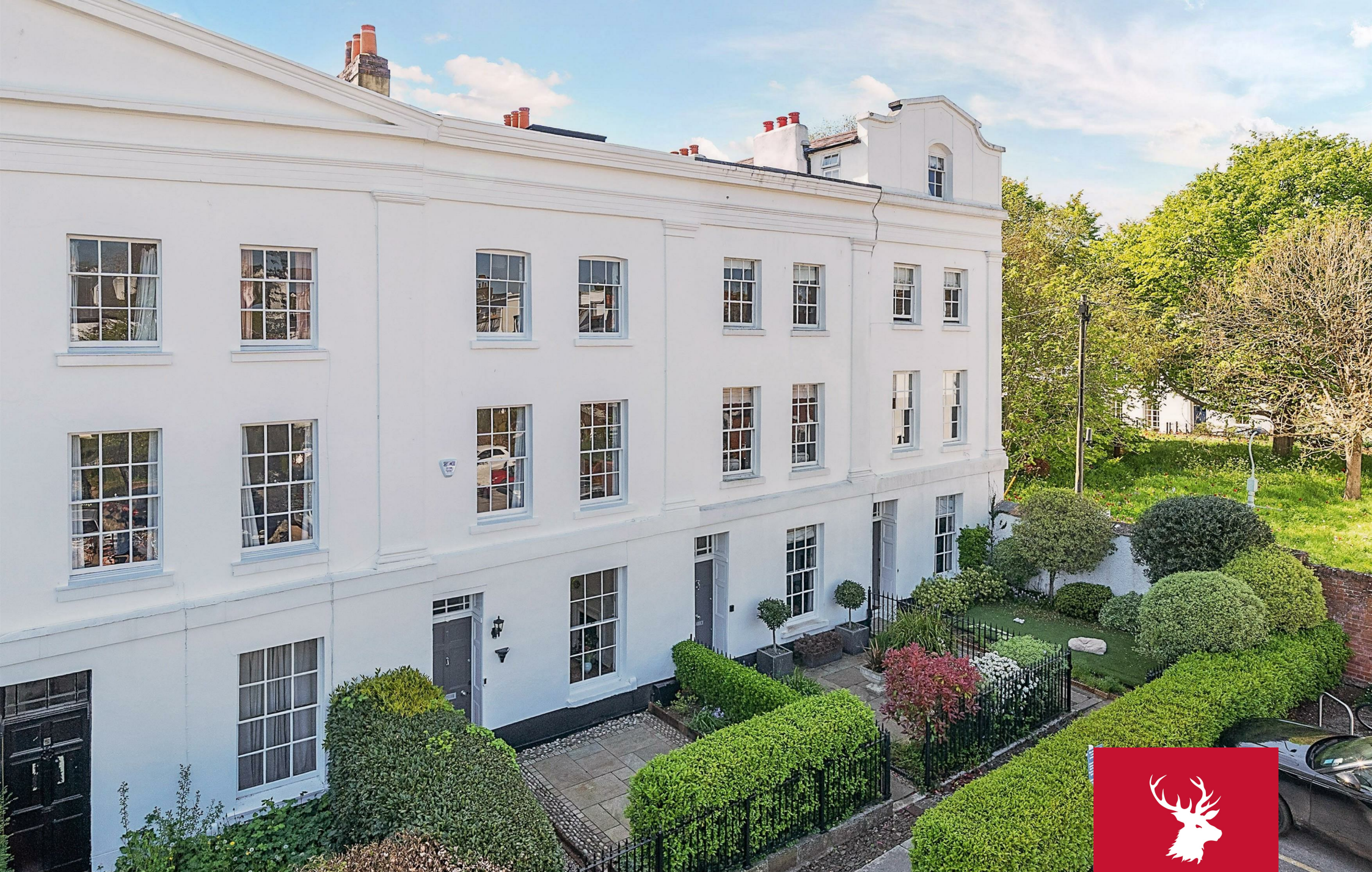
7 Silver Terrace