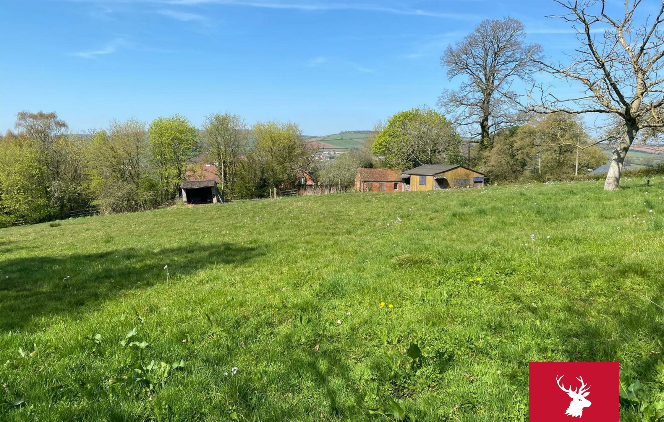
Land at Whitley Copse