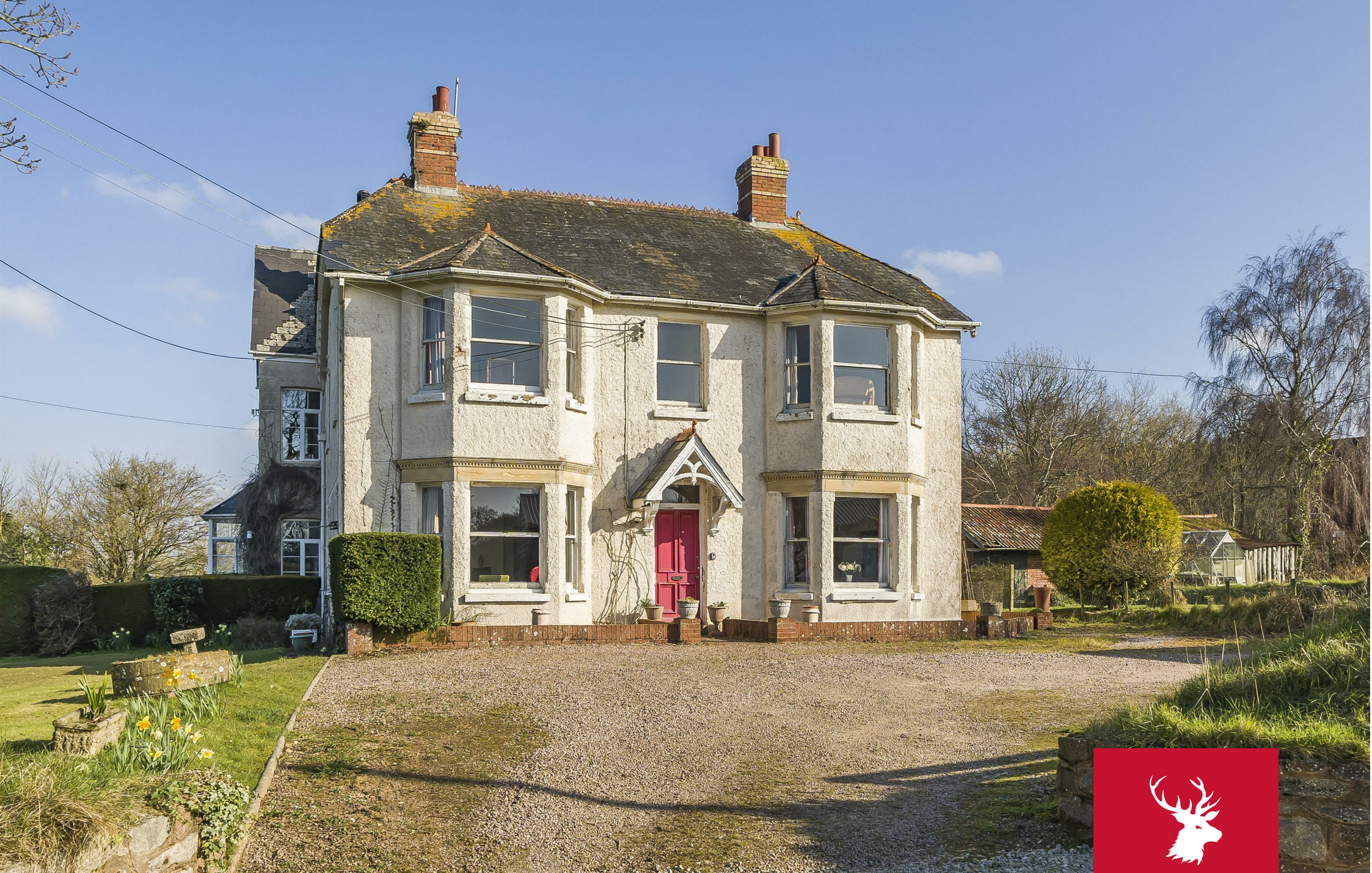
Cannonwalls Farm House