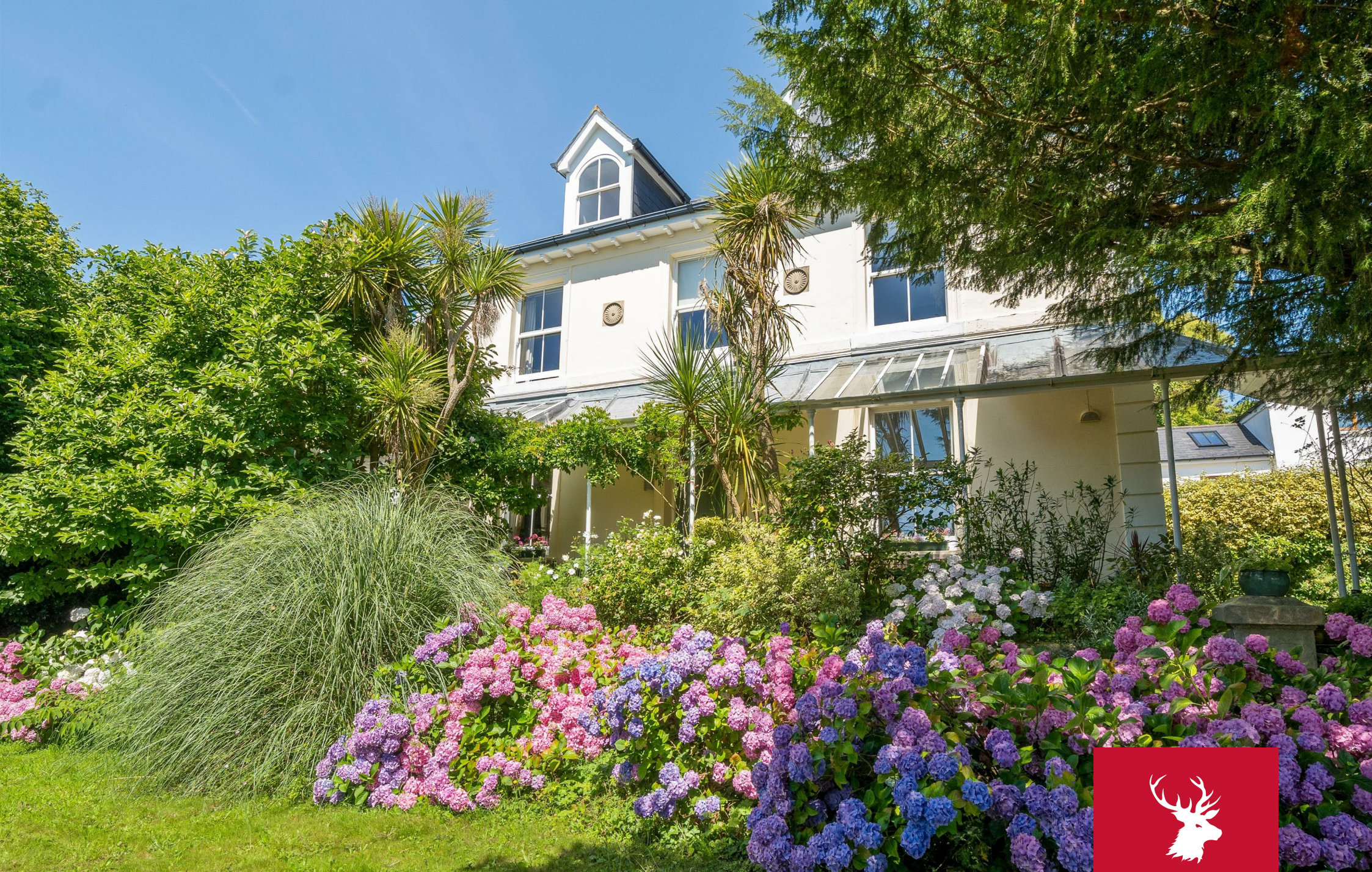
Ashwell, East Street