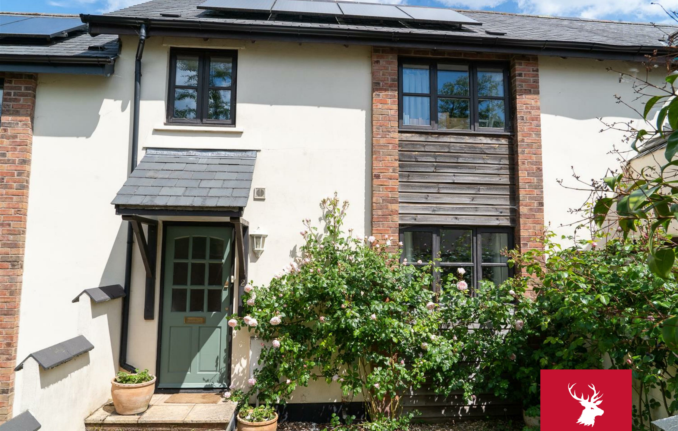
2 Halls Garden