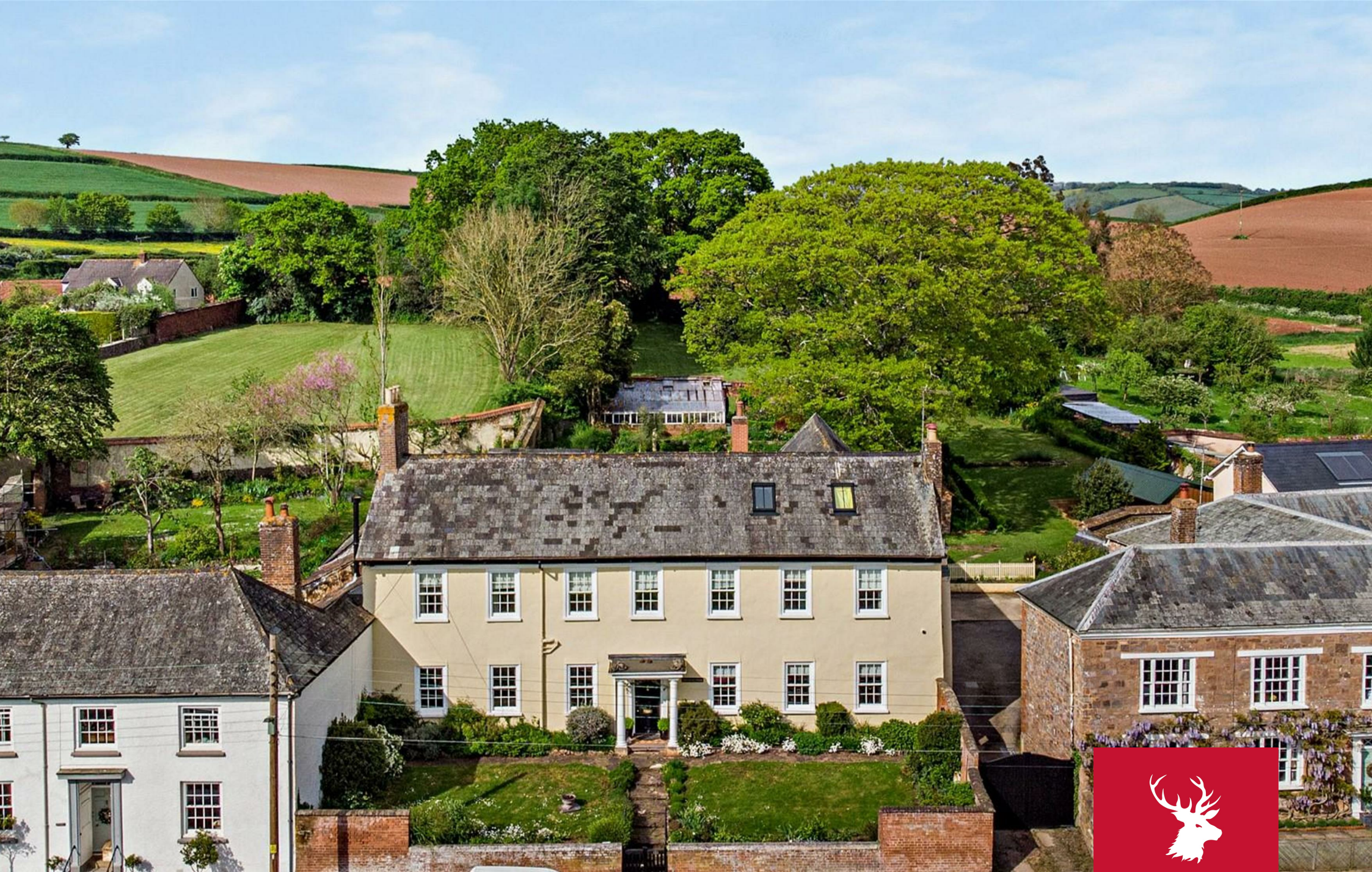
Thorverton House, Silver Street