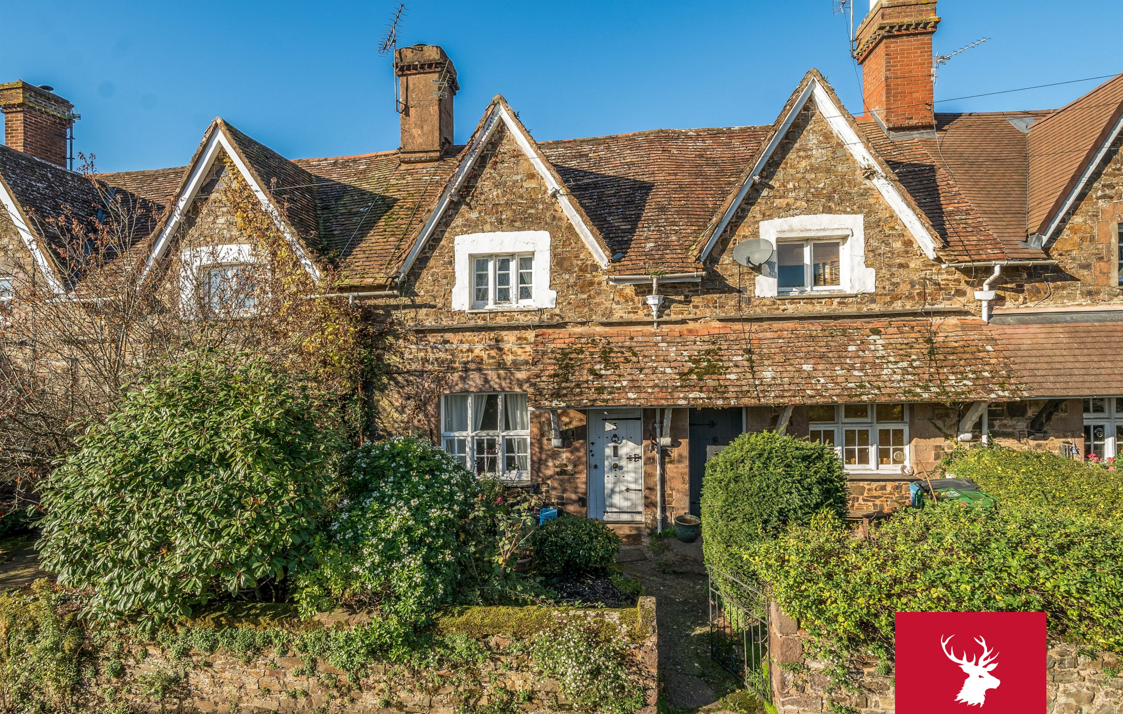
3 Myrtle Cottages