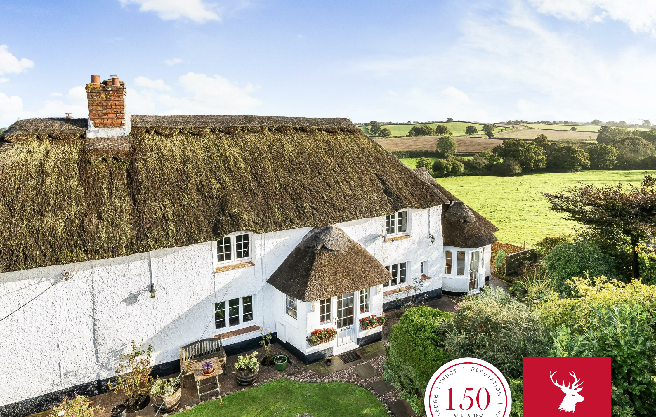
3 Olivers Cottage