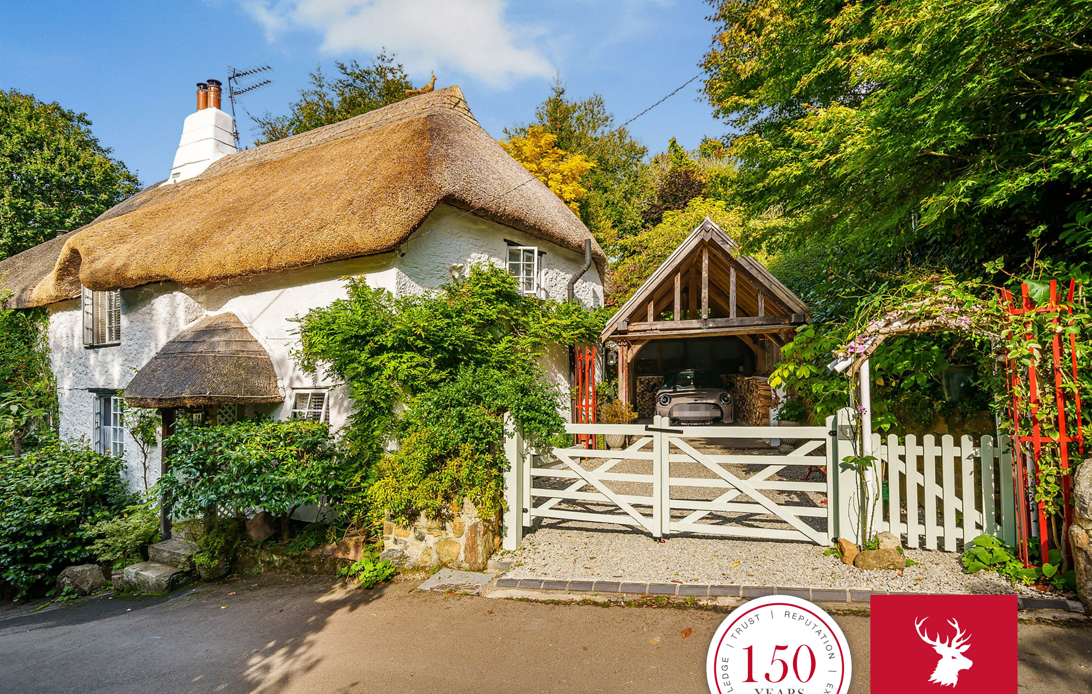
1 Southbrook Cottage