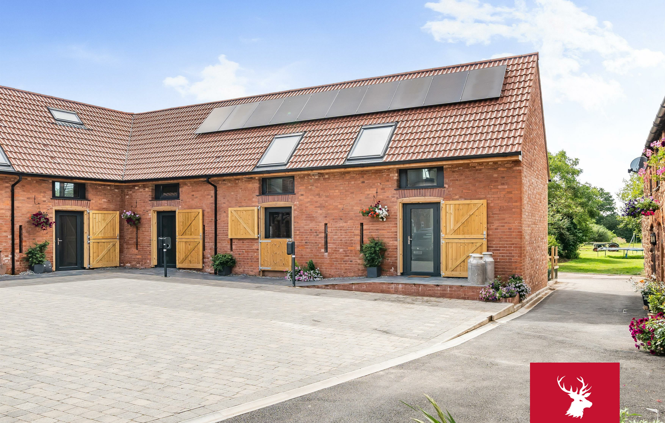
7, The Old Stables