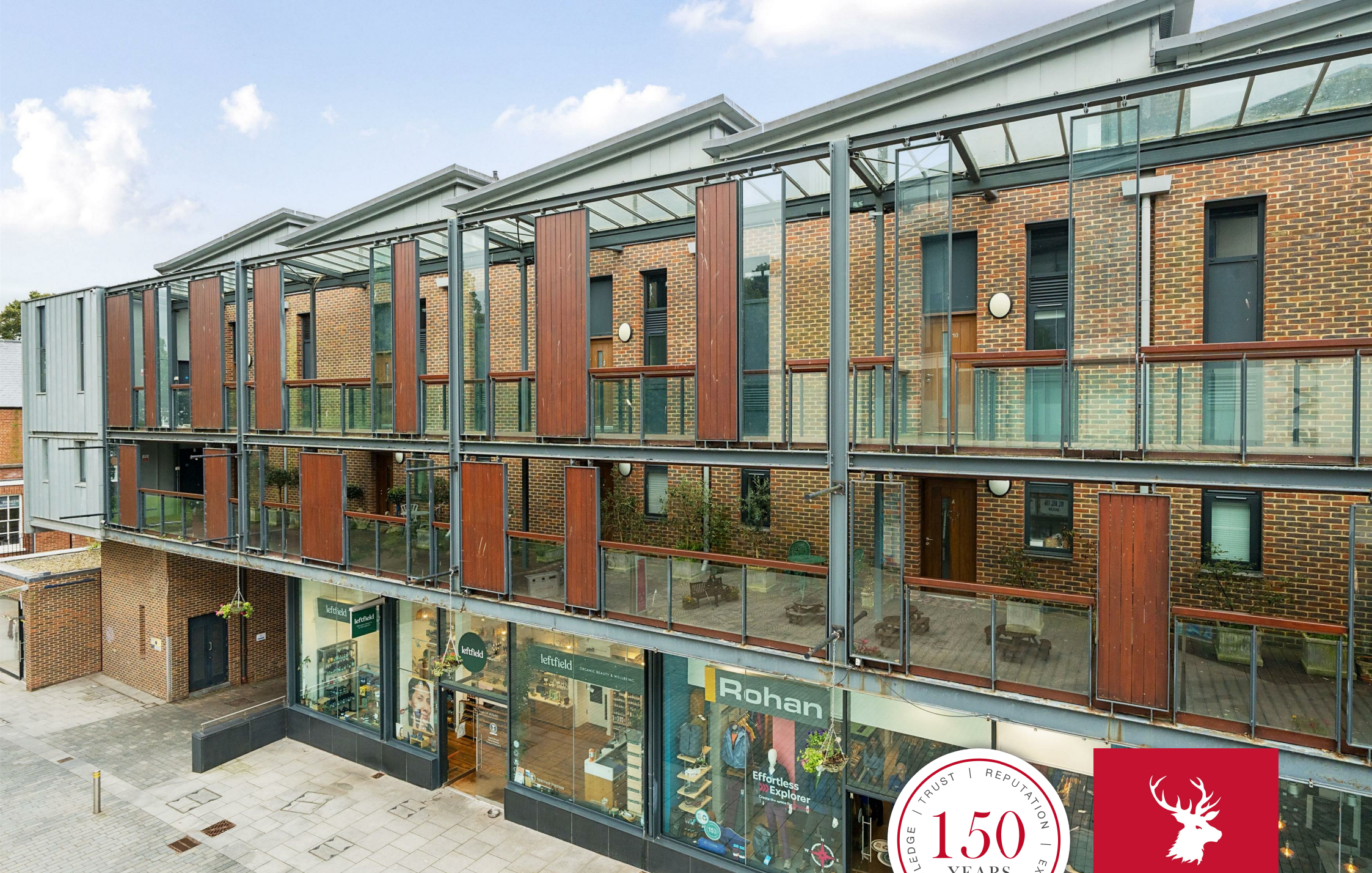
Flat 9 Canon House