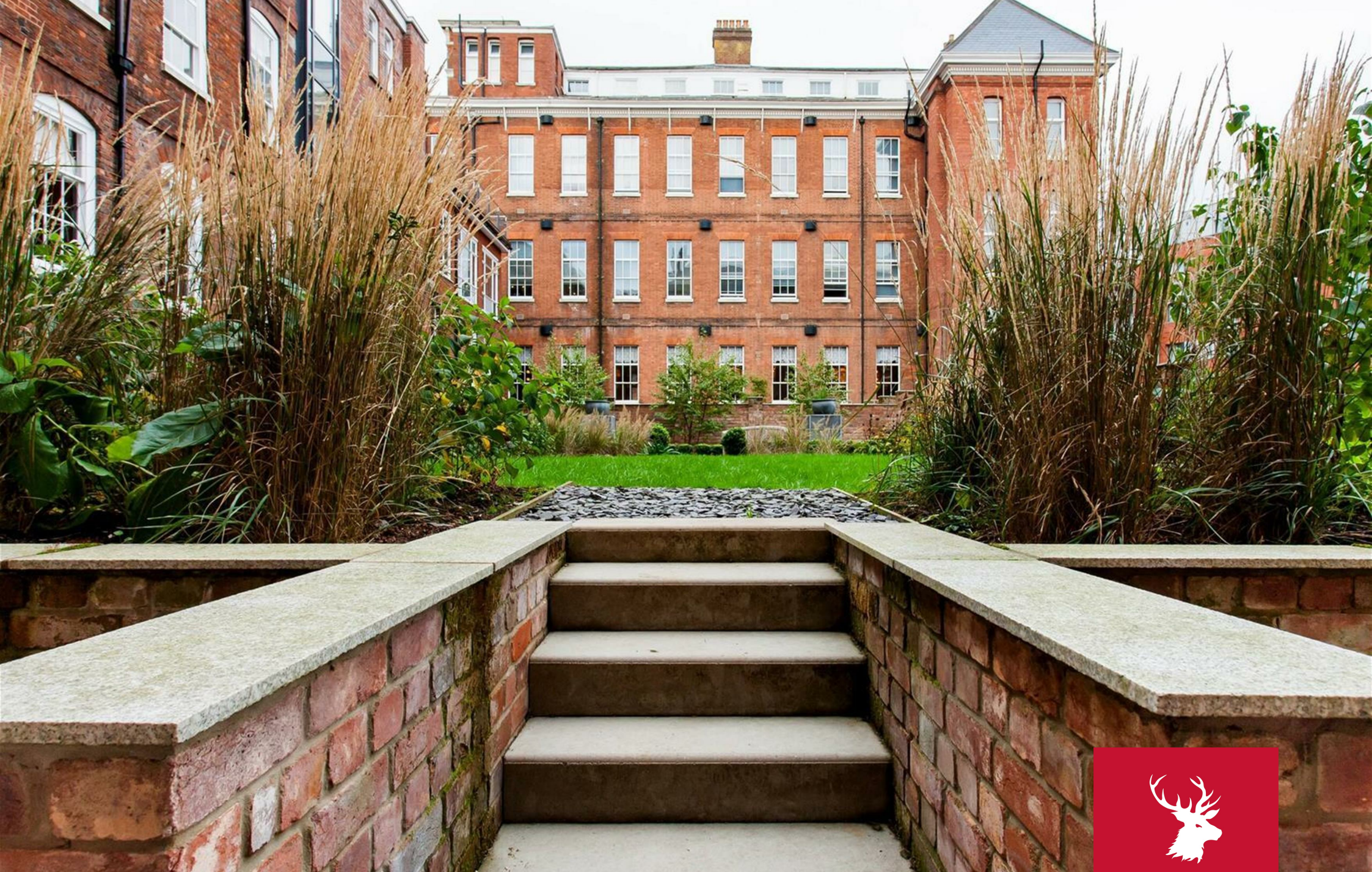
3, Dean Clarke House