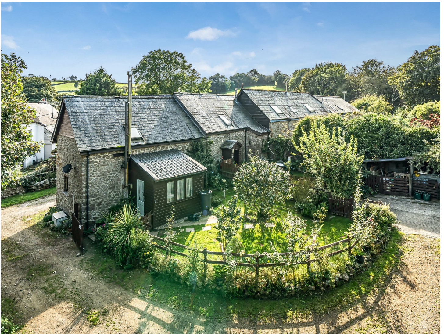
1 & 2 Westcott Cottages