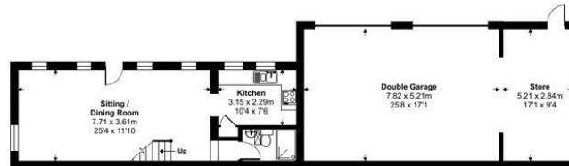
Annexe - Ground Floor