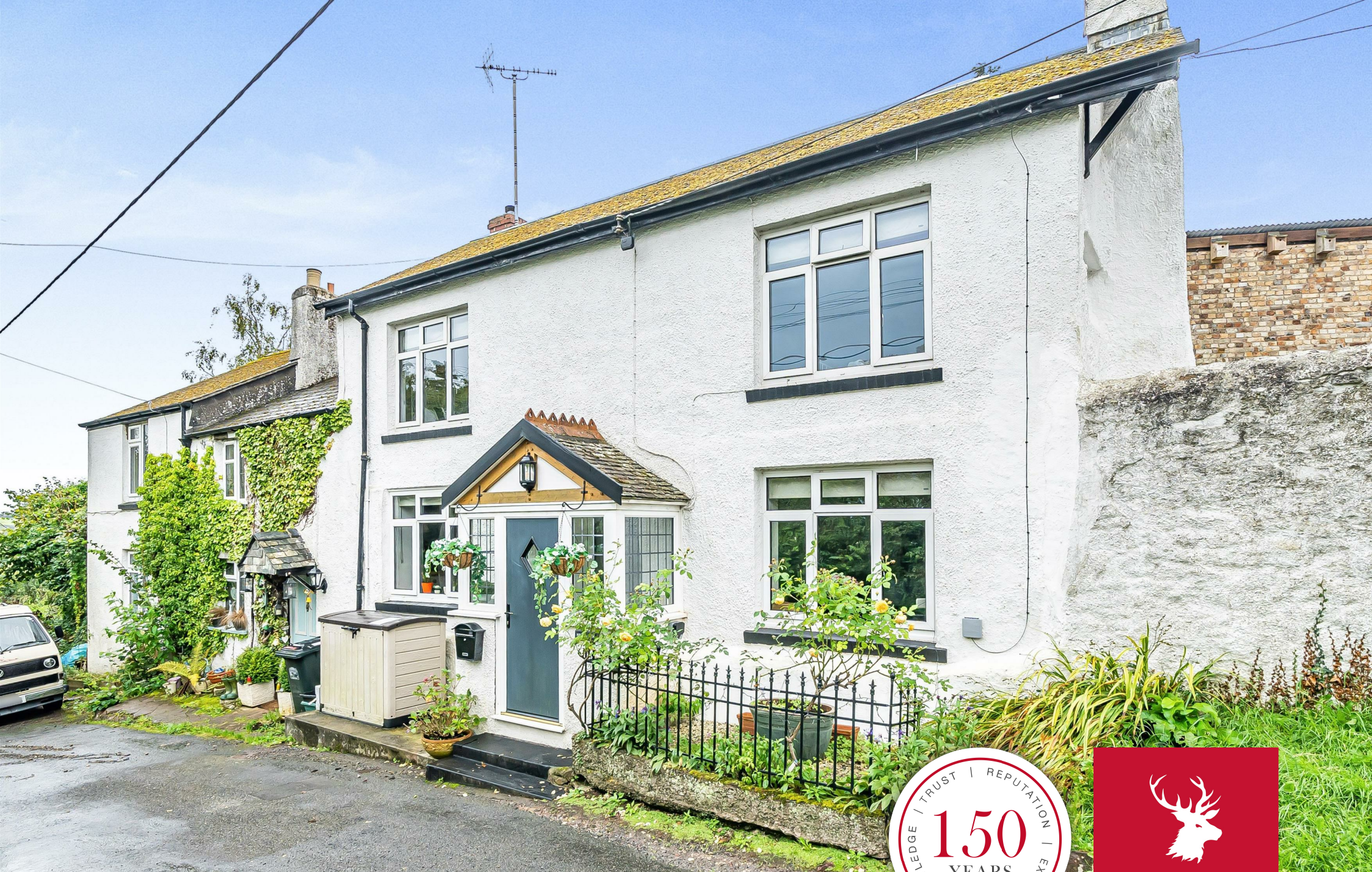
Haldon View, Coombe Way