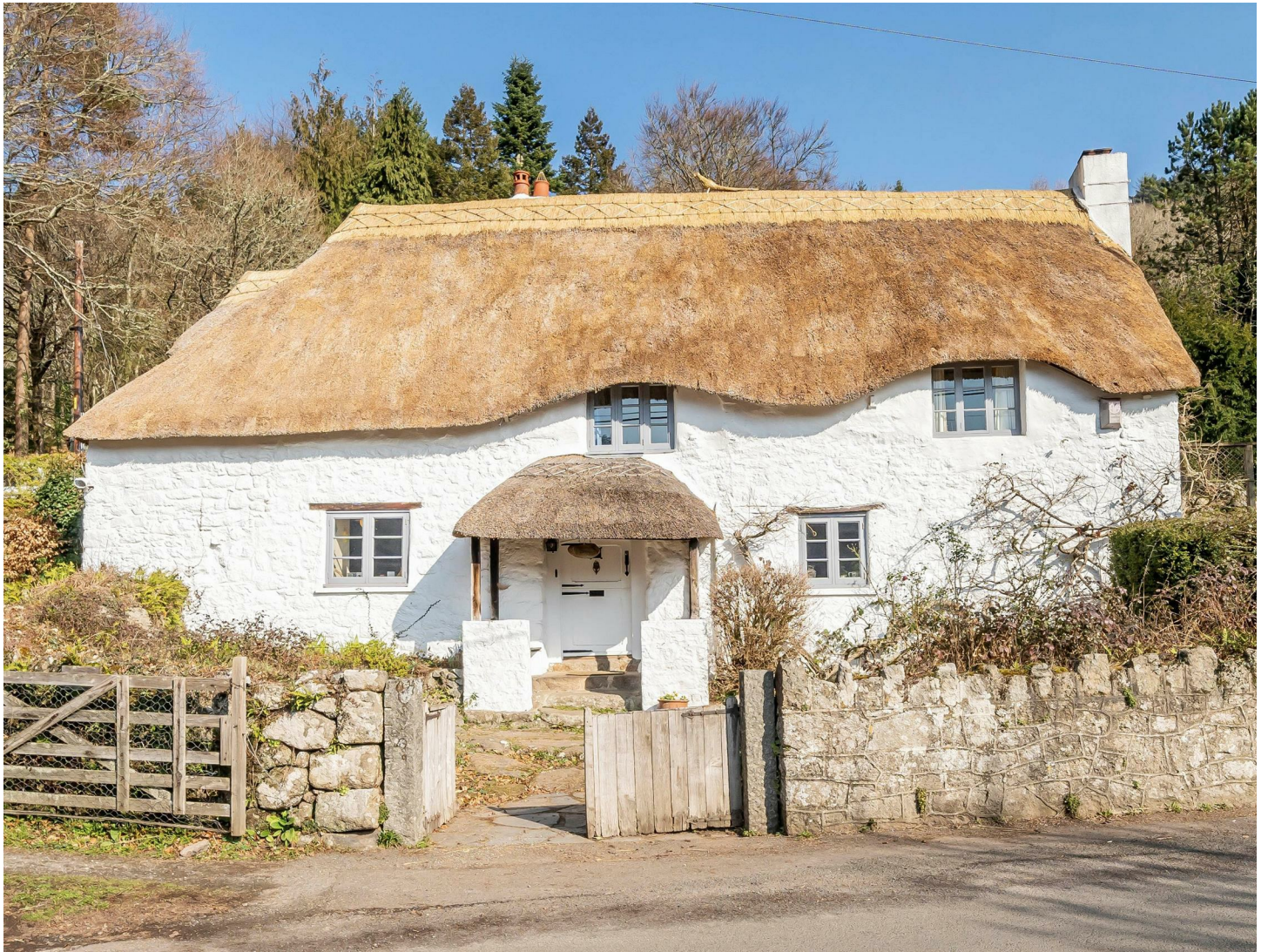
Willow Wray Cottage