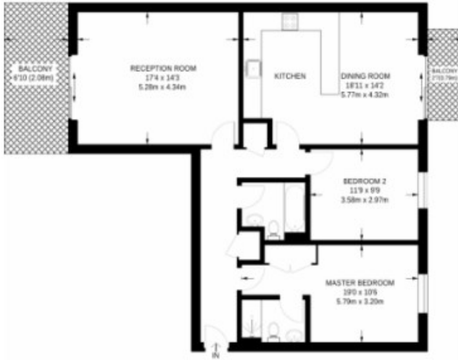
SIXTH FLOOR 1035 SQ FT / 96.2 SQ M