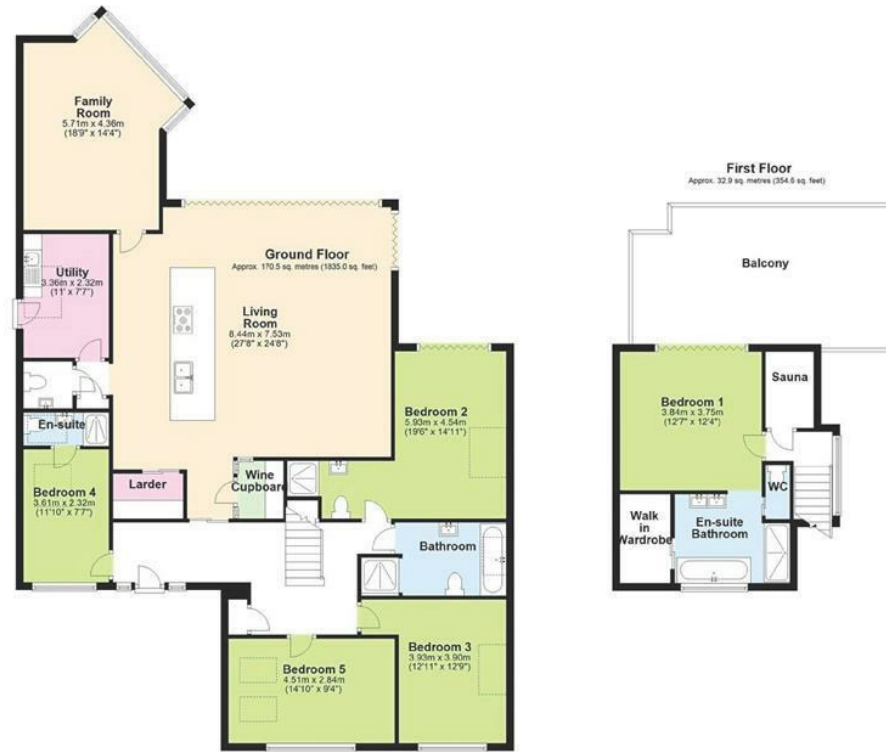
Ground floor and 1st floor total area approx 2189.6 sq. feet (203.4 sq.m.)