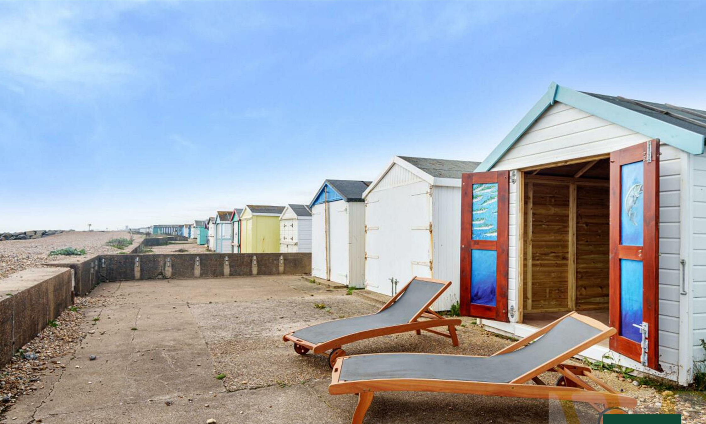
Beach Hut 40 West Beach | | Shoreham-By-Sea | BN43 5LF