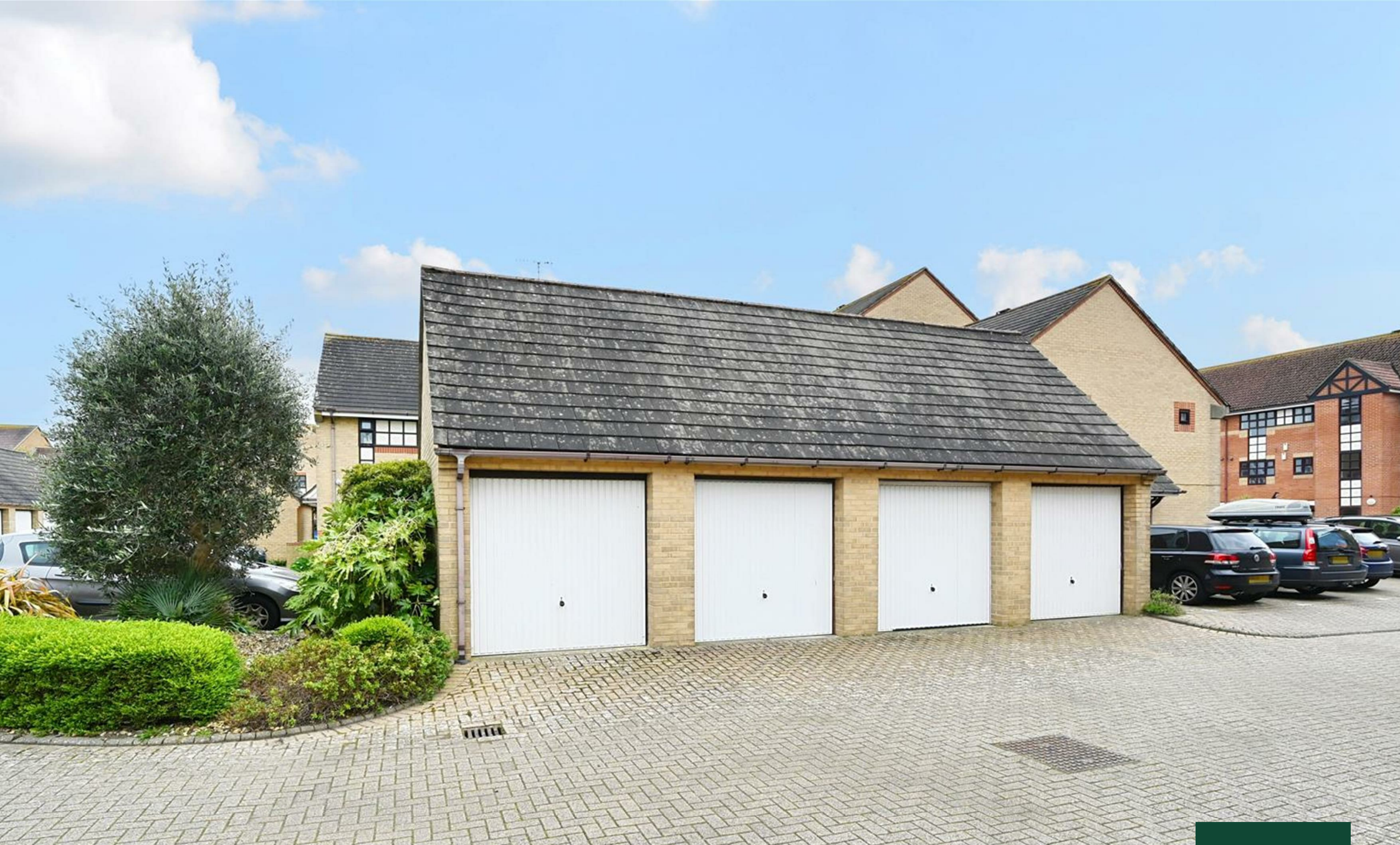
Garage 106 Emerald Quay | | Shoreham-By-Sea | BN43 5JS