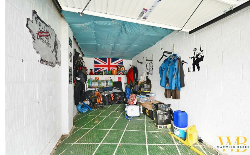
Garage 106 Emerald Quay | | Shoreham-By-Sea | BN43 5JS