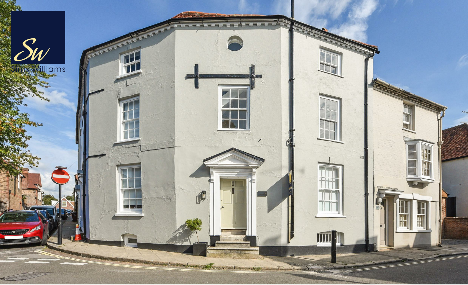
THE OLD PUB, 72 TARRANT STREET, ARUNDEL, WEST SUSSEX, BN18 9DN