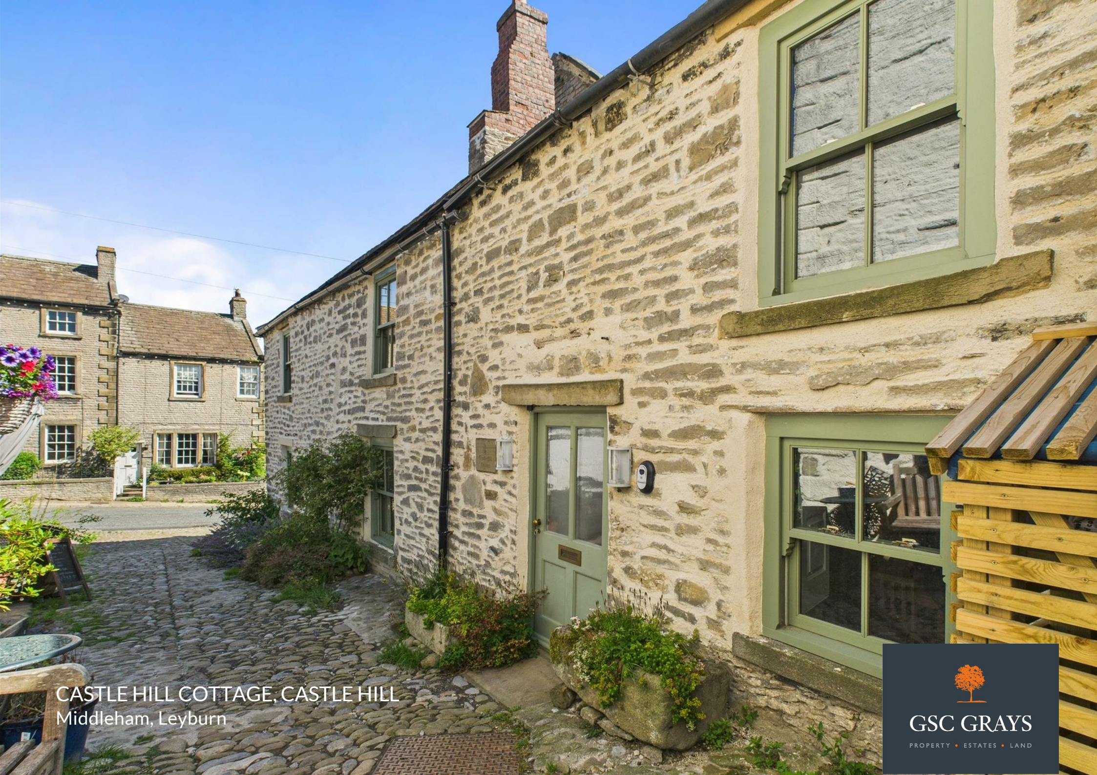
CASTLE HILL COTTAGE, CASTLE HILL Middleham, Leyburn