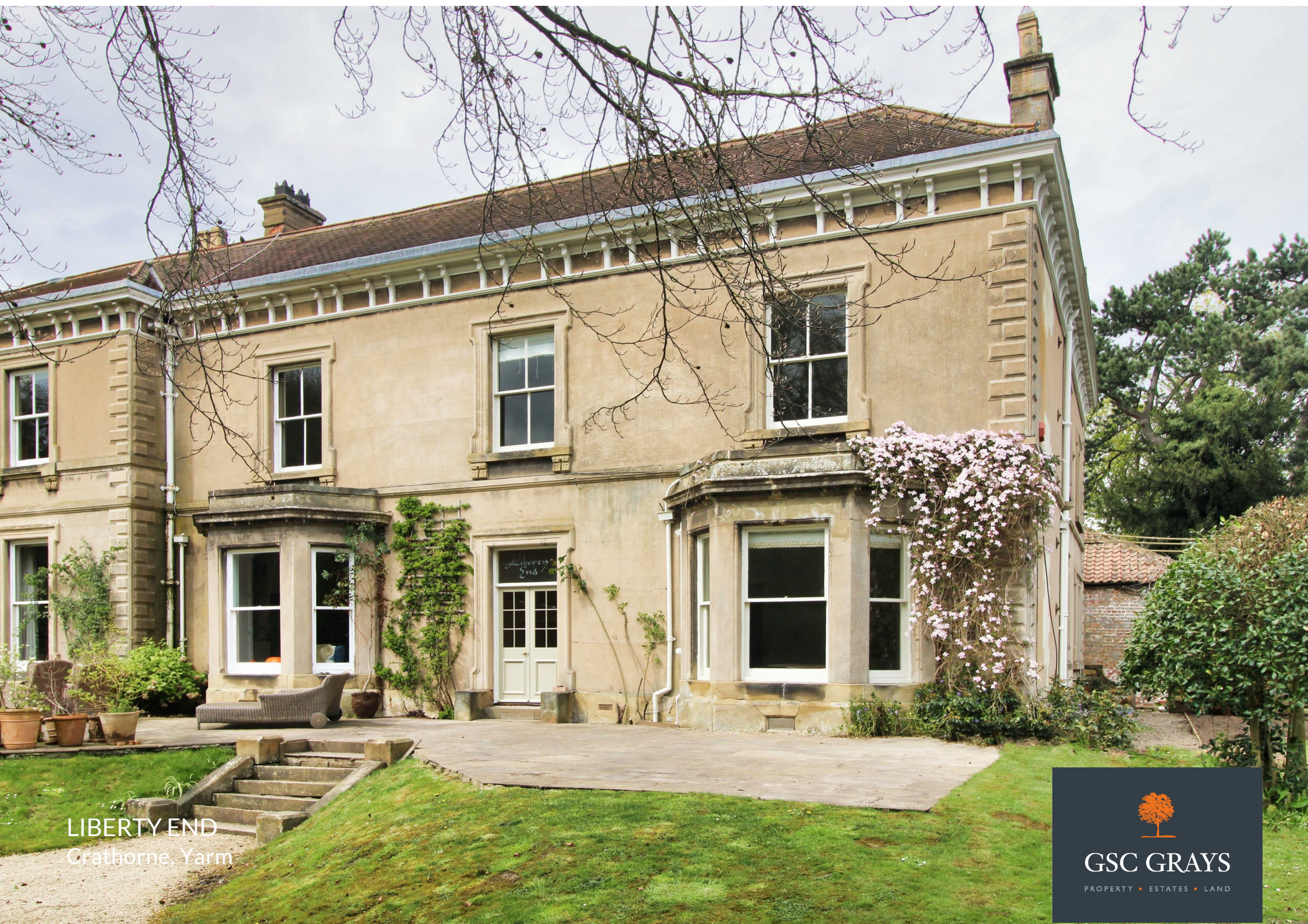
LIBERTY END Crathorne, Yarm