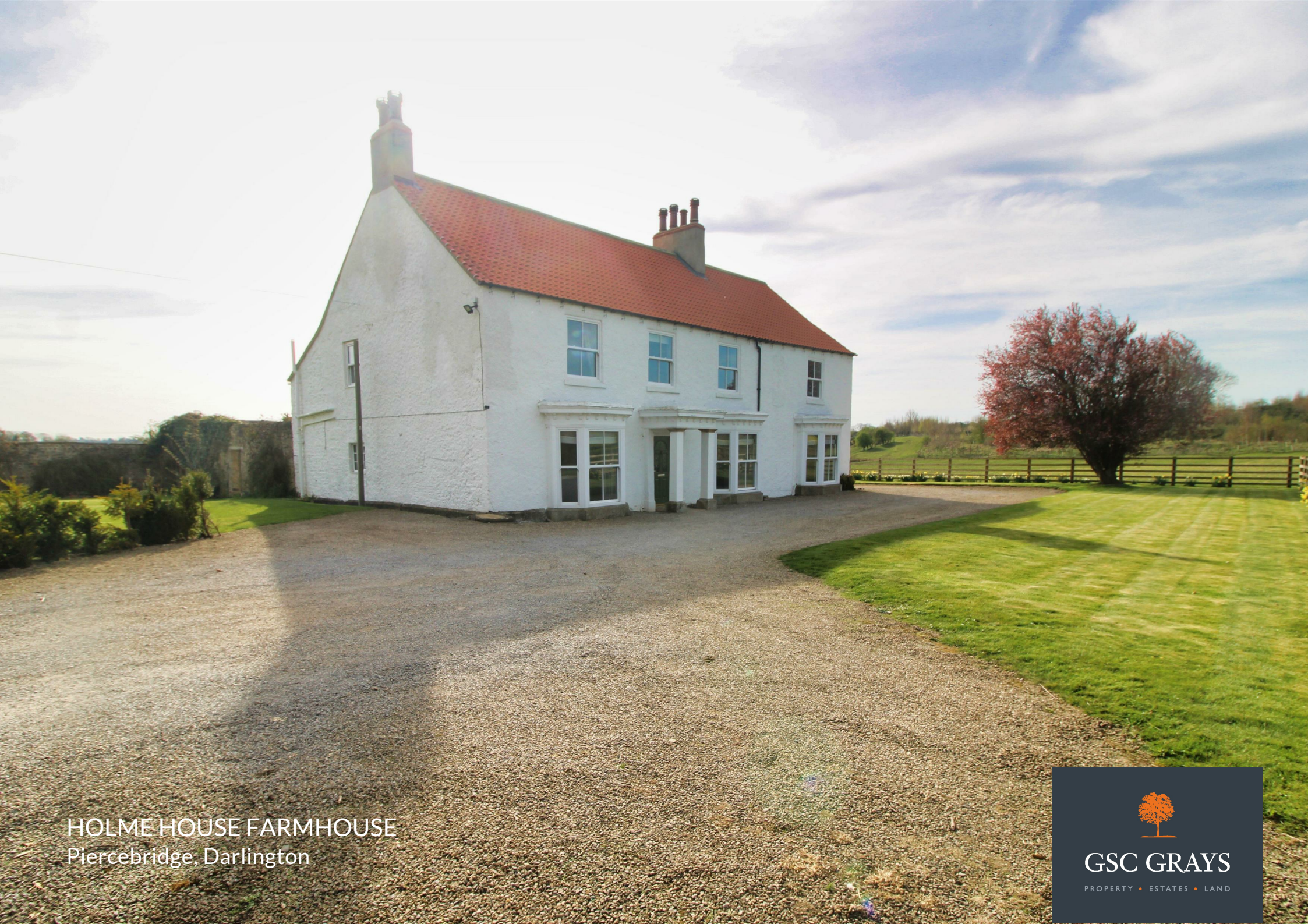
HOLME HOUSE FARMHOUSE Piercebridge, Darlington