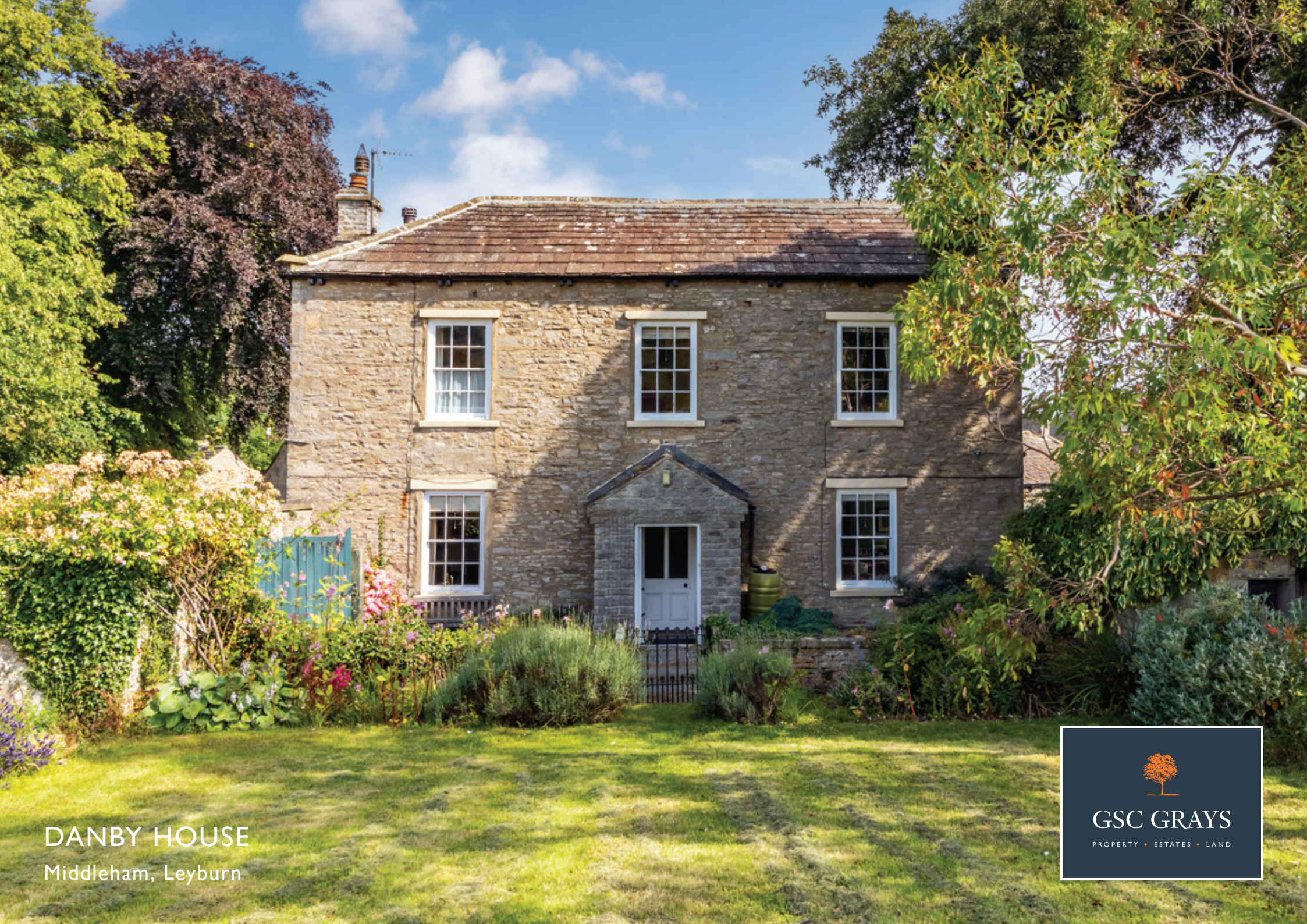
DANBY HOUSE Middleham, Leyburn