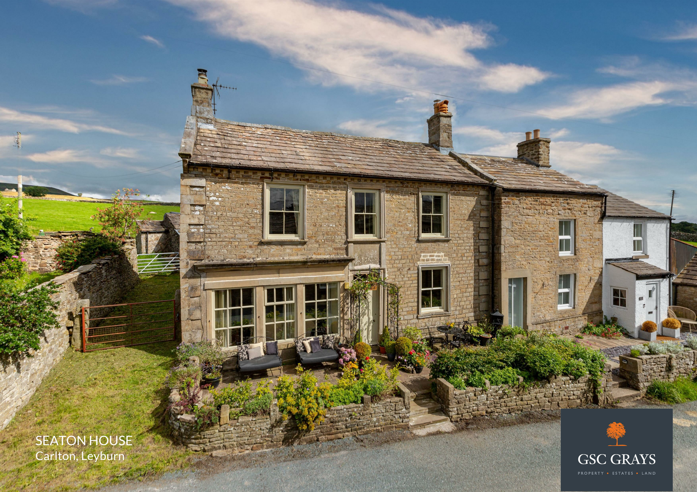
SEATON HOUSE Carlton, Leyburn