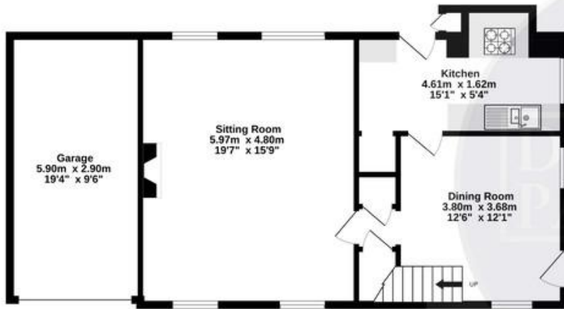
Ground Floor 73.4 sq.m. (795 sq.ft.) approx.