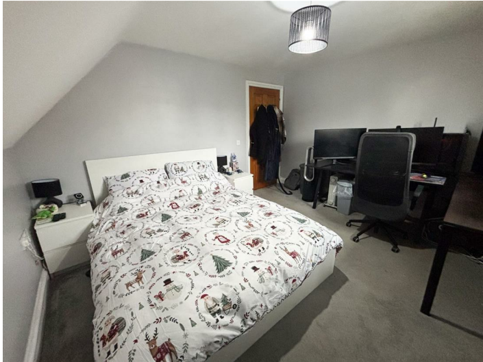
Window to side.