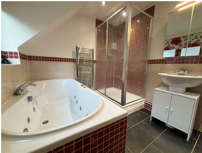
Jacuzzi bath (not tested), shower cubicle, wash basin, tiled floor, ½ tiled walls, extractor fan.