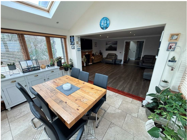
Tiled floor, double doors to patio.