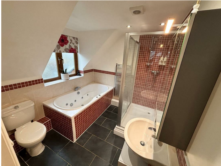
EN SUITE BATHROOM 8'6 x 7'5 (2.59m x 2.26m)