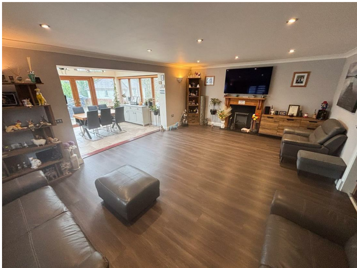
A fabulous spacious room with window to fore. Fireplace with real flame effect with wooden mantle and surround. Ceiling lights and laminated floor.