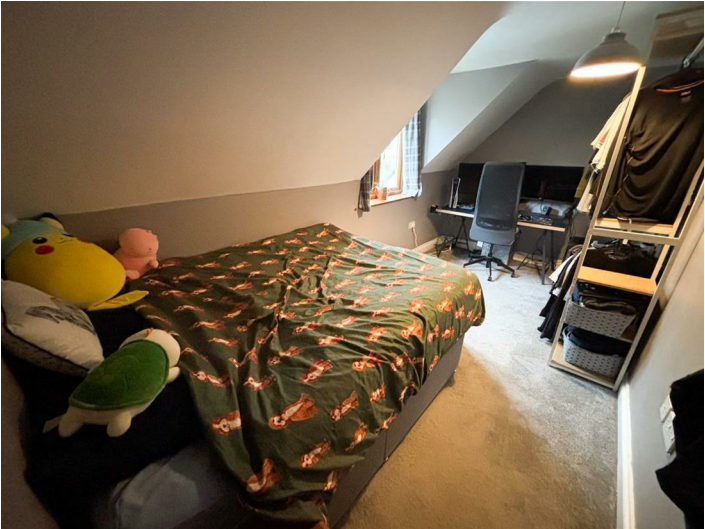
Window to side.