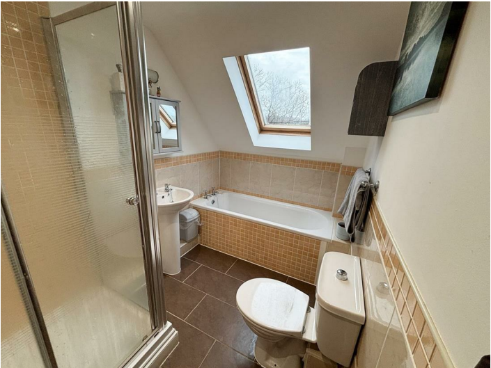
Shower cubicle, washbasin, bath and WC. Velux window, part tiled, tiled floor, extractor fan.