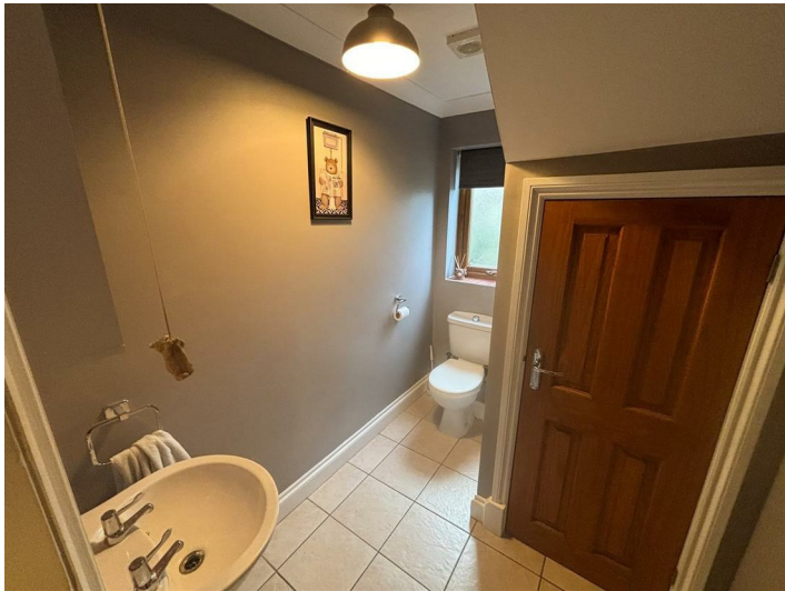
with washbasin, tiled floor and obscured window to rear. Large understairs cupboard.