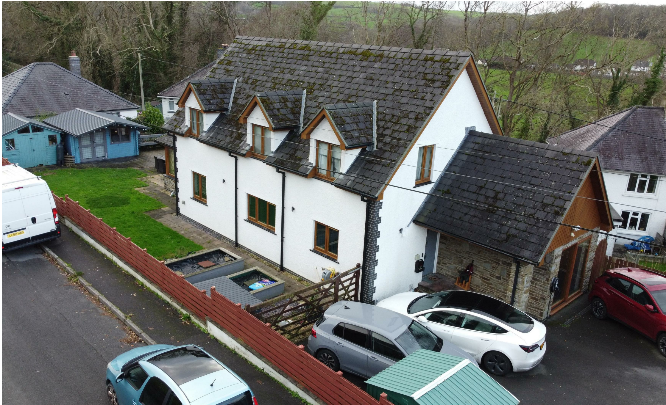
5 Clos Elan Lon Ty Llwyd, Llanfarian Aberystwyth Ceredigion SY23 4UL Guide price £395,000