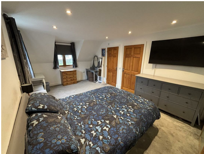
Windows to fore and side. Fitted mirrored wardrobes along one wall. Door to