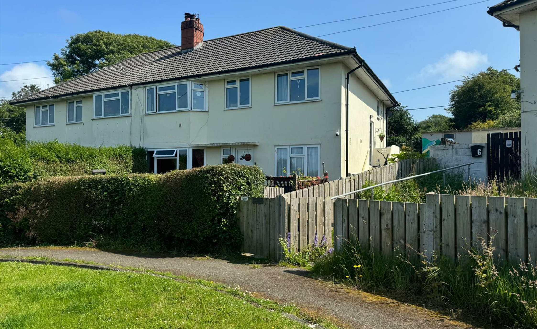
4 Heol Rhydygarreg, Borth Ceredigion SY24 5NZ Guide price £140,000