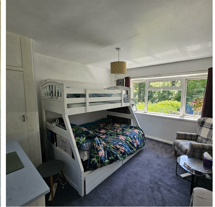
Airing cupboard, radiator and window to rear.