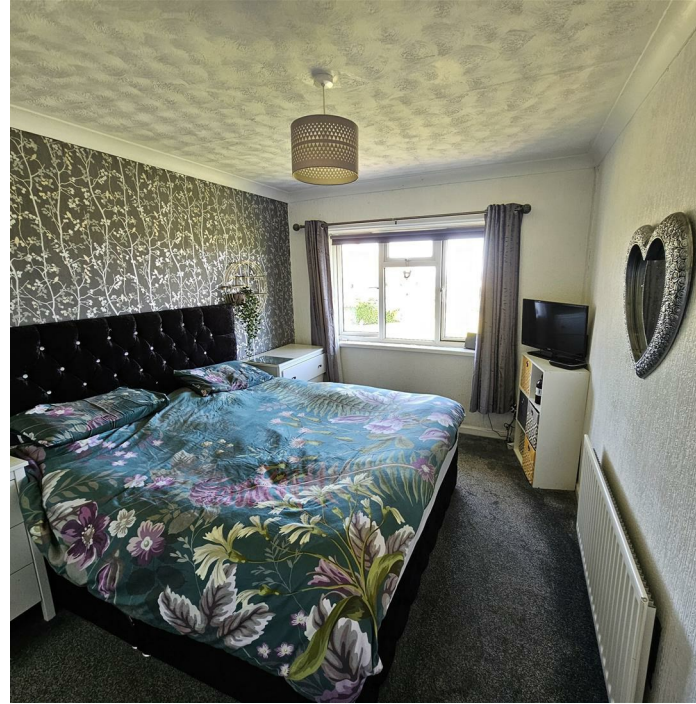
Fitted wardrobe, window to fore with fine views, radiator.