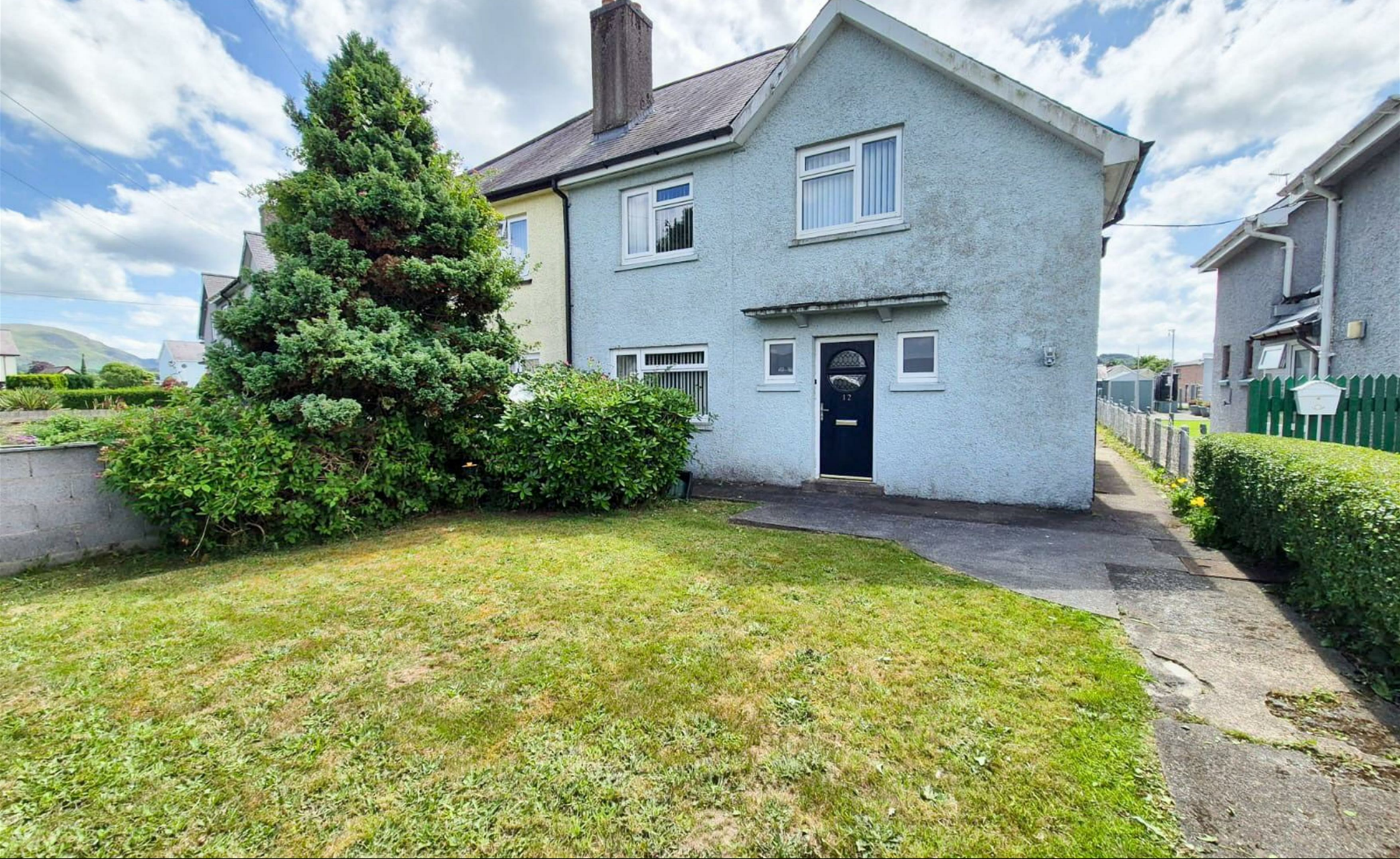
12 Brynheulog, Tregaron SY25 6JA Guide price £175,000