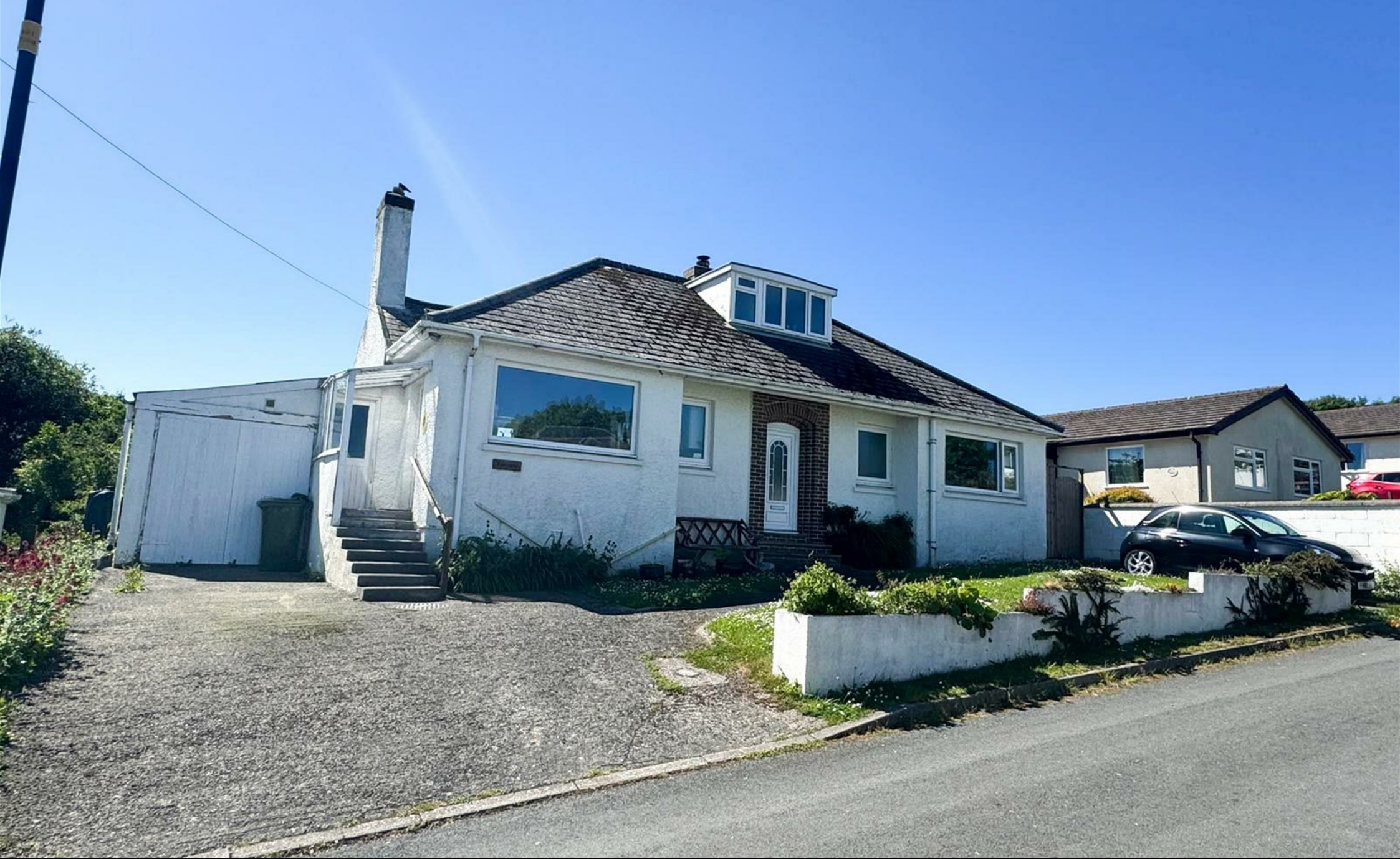
Fairview, Ffordd y Fulfran, Borth Aberystwyth Ceredigion SY24 5ND Guide price £345,000