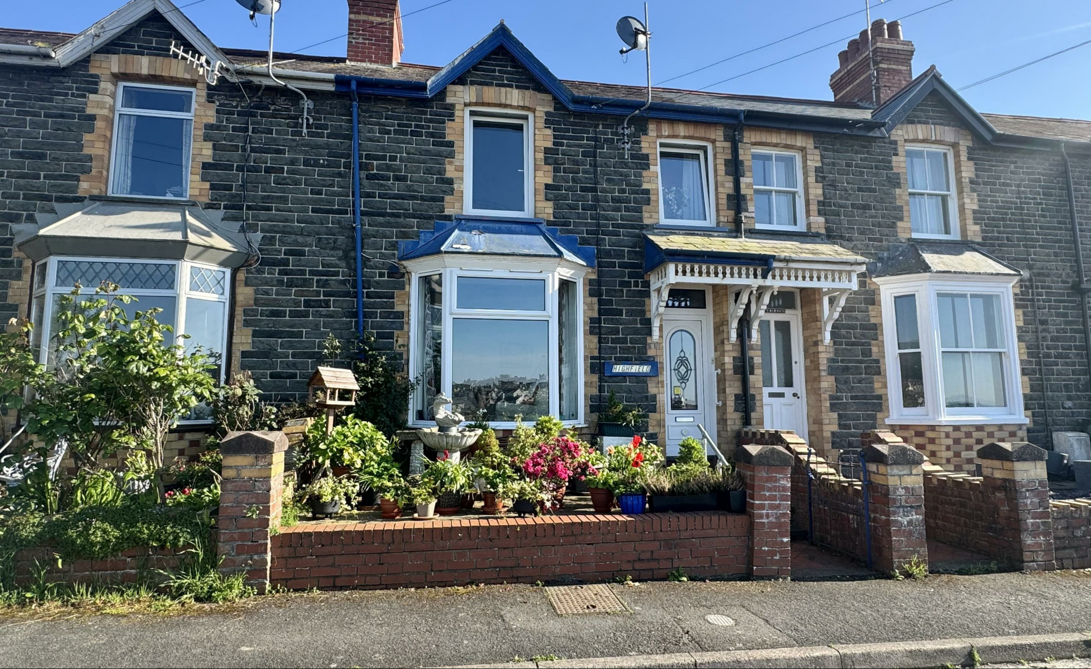
22 Dinas Terrace, Aberystwyth Ceredigion SY23 1BT Guide price £299,000