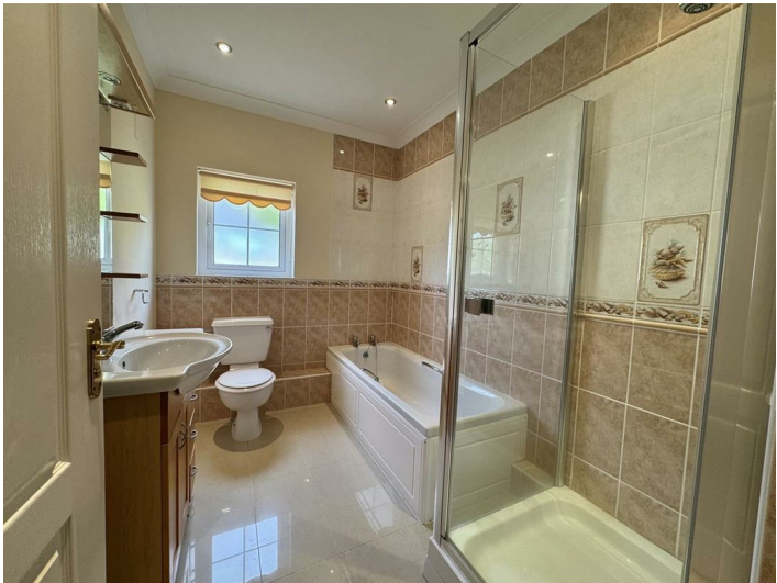
with bath, shower cubicle, WC and wash hand basin with illuminated splashback units which contain shaver Heated towel rail and tiled splashbacks.