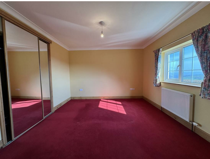
with fitted mirrored wardrobes, window to side, radiator and access to