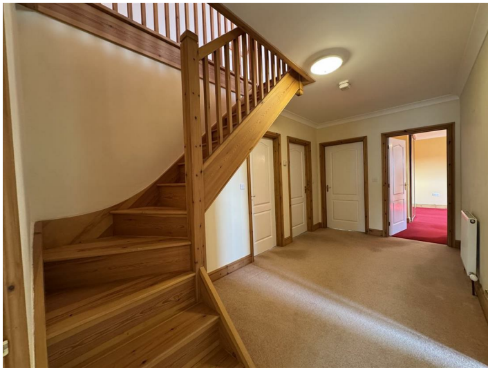
with stairs to first floor accommodation, under stairs storage and radiator. Door to