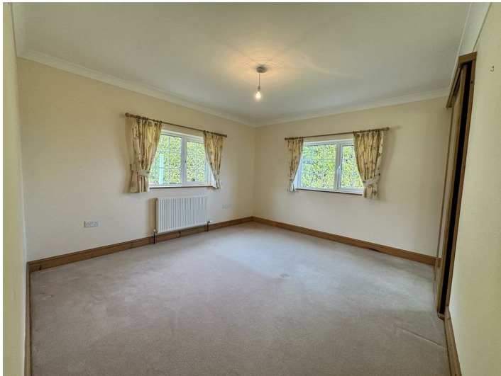
with fitted mirrored wardrobe, windows to rear and side Radiator.