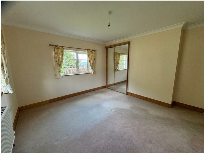
BEDROOM 4 9'1 x 10'7 (2.77m x 3.23m )