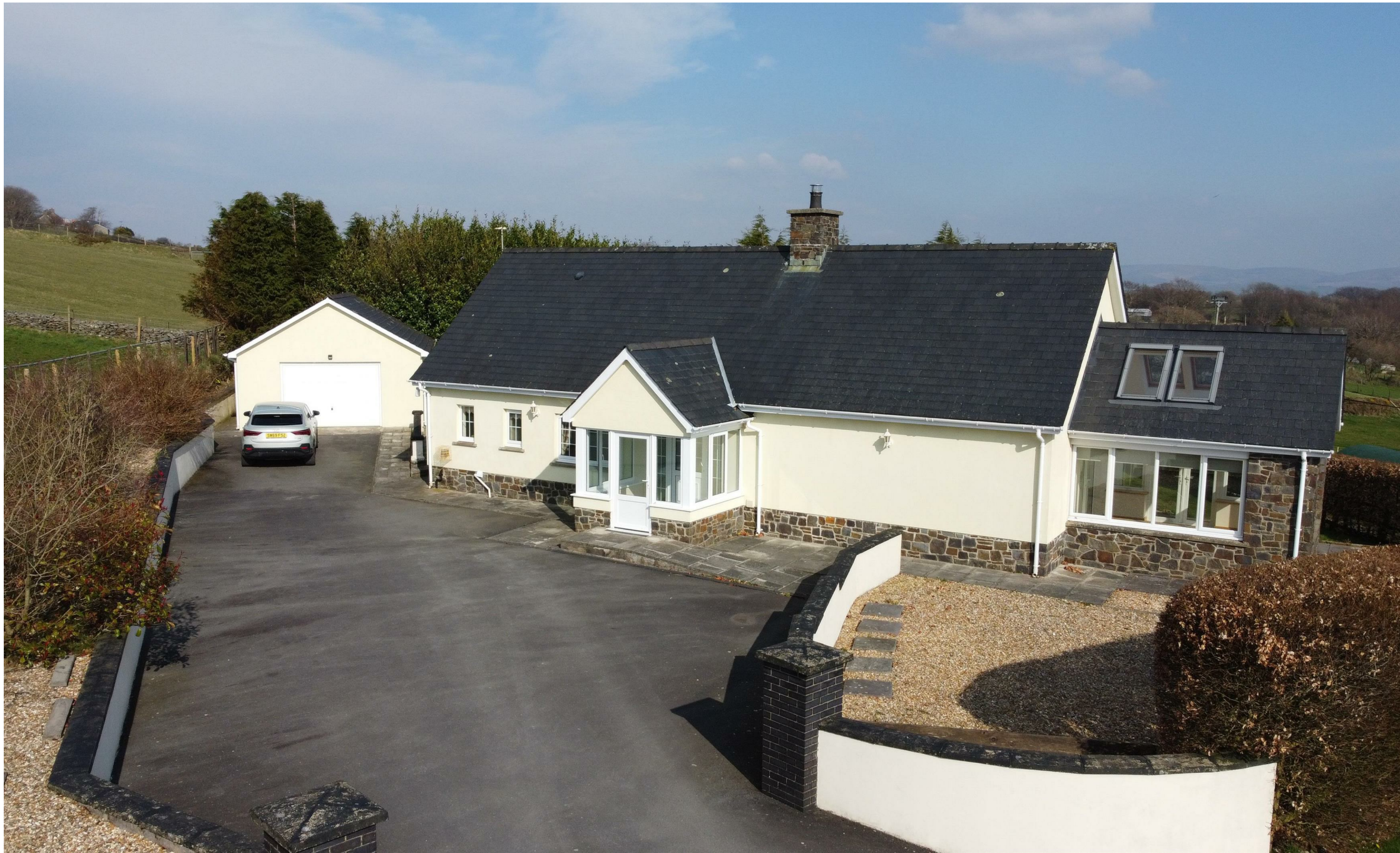
Hafod Wen , Penuwch Tregaon Ceredigion SY25 6RA Guide price £440,000