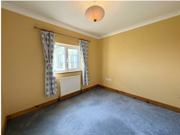
with window to side and radiator.