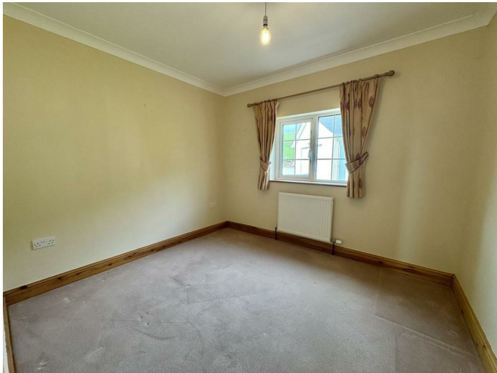
with window to side and radiator.