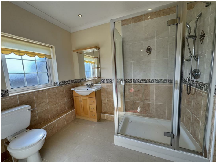
comprising low level flush WC, wash basin set in bathroom furniture with illuminated splashback , shower cubicle, tiled floor, part tiled walls, heated towel rail and obscured window to side.