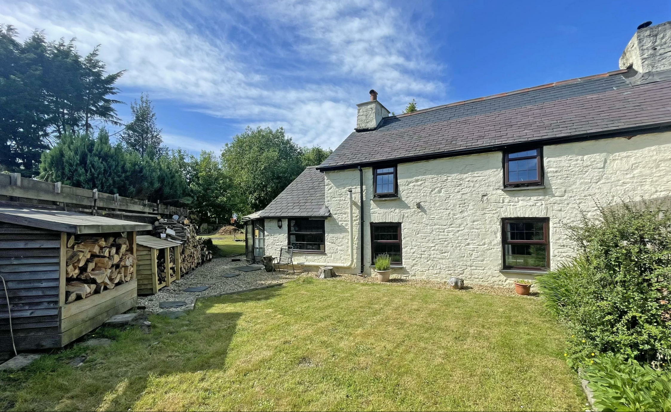
Briwnant , Bronant Aberystwyth Ceredigion SY23 4TG Guide price £195,000