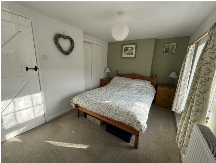
Fitted wardrobe, 2 windows to the fore and radiator.