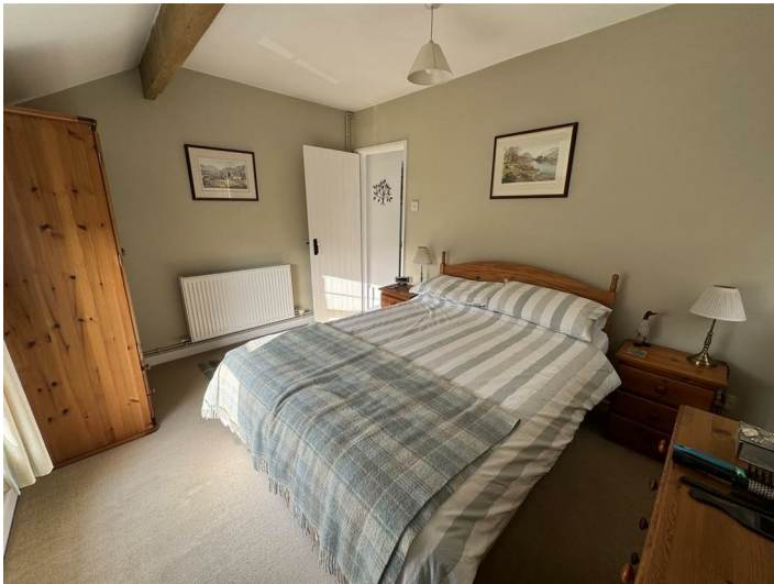
Windows to fore and side, radiator.