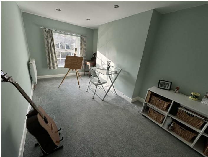
Window to fore, radiator, access to roofspace, ceiling lights.