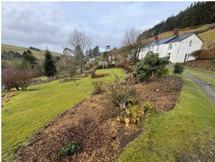
Driveway leading to vehicular hardstanding. Garden Shed 15' x 15' Approx Front Patio Large garden to the fore predominately laid to lawn with pond, flower border, trees and shrubs.