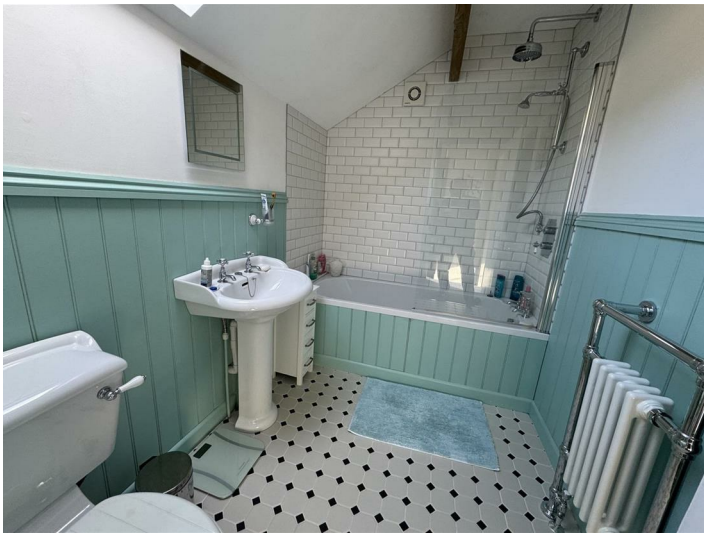
WC, Pedestal Washbasin and panelled Bath with Mixer Tap over and Screen. Heated Towel Rail. Velux Window.