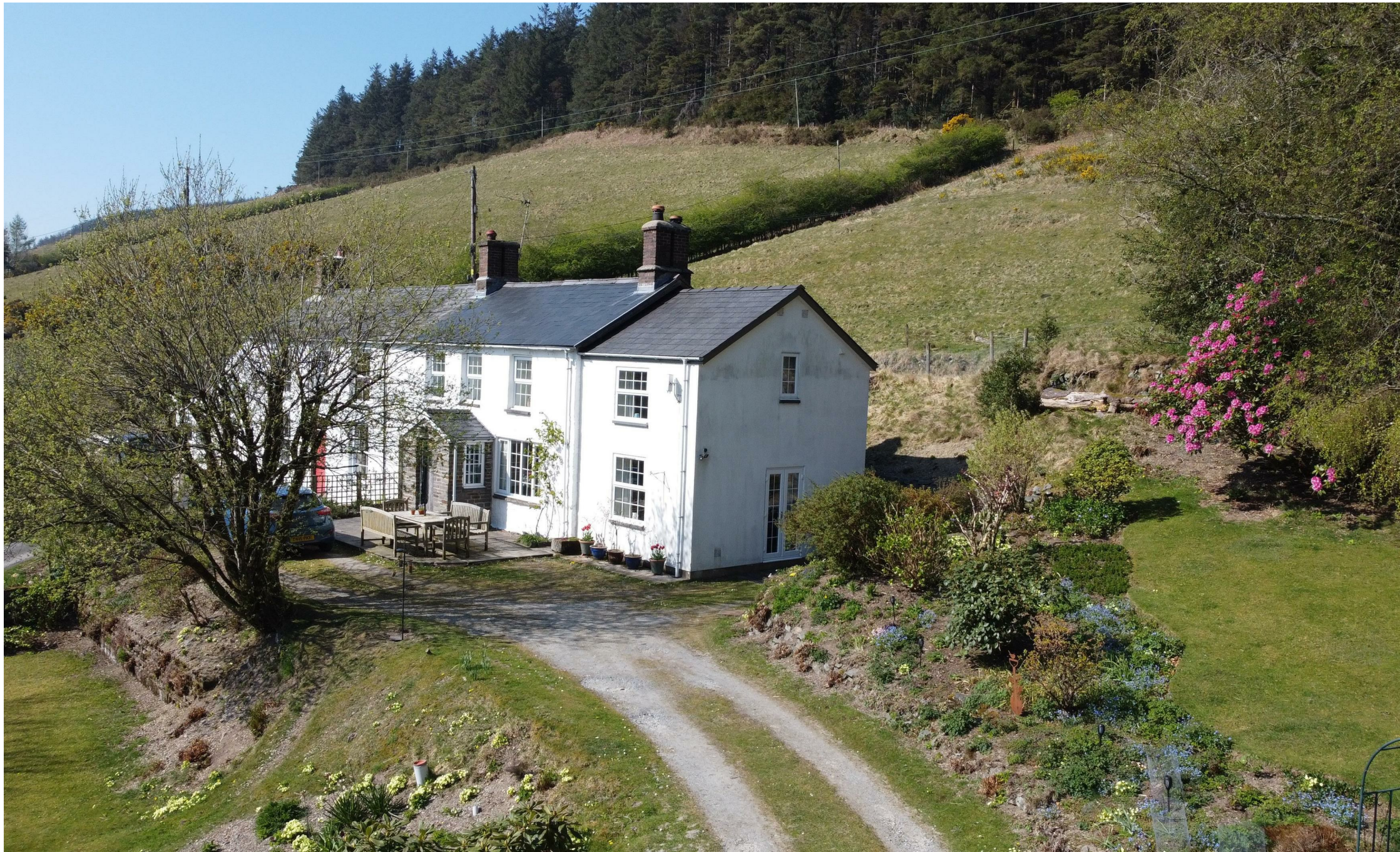
Crud Yr Awel , Cwmsymlog SY23 3HA Guide price £315,000