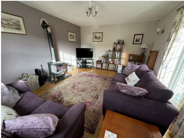
Aga Multi Fuel room heating range on a slate plinth, wooden floor, French doors to side, radiator and window to fore.