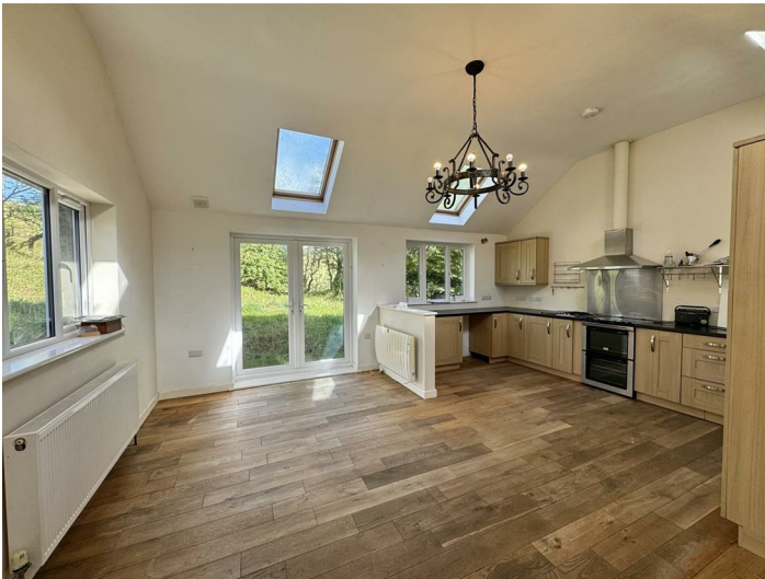
A beautifully bright open plan kitchen diner with shaker style fitted kitchen with a range of base & eye level units, double oven with hob over, appliance spaces, stainless steel sink with mixer tap and extractor fan hood. Window to fore,