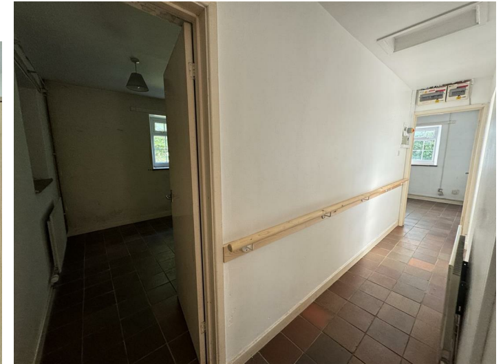
With radiator, access to loft space and doors through to