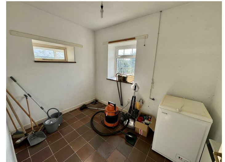
A great space for a home office or utility area with tiled flooring, storage heater, window to fore and side.