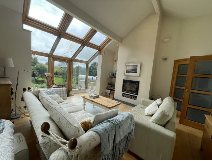
A gorgeous bright and spacious living area with a built in floating wood burner, laminate oak flooring with zoned underfloor heating, oak framed bay feature window with veluxes overlooking the garden.