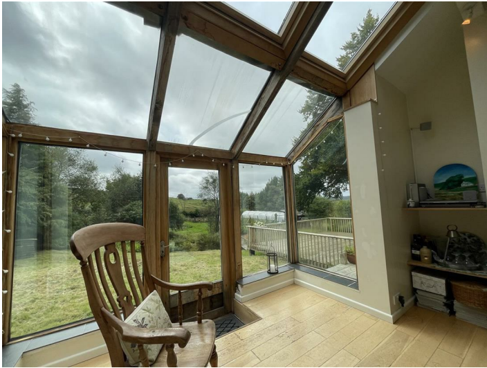
From Dining Area