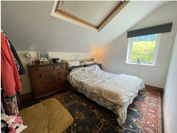
With underfloor heated tiled flooring, large velux window and window to side.